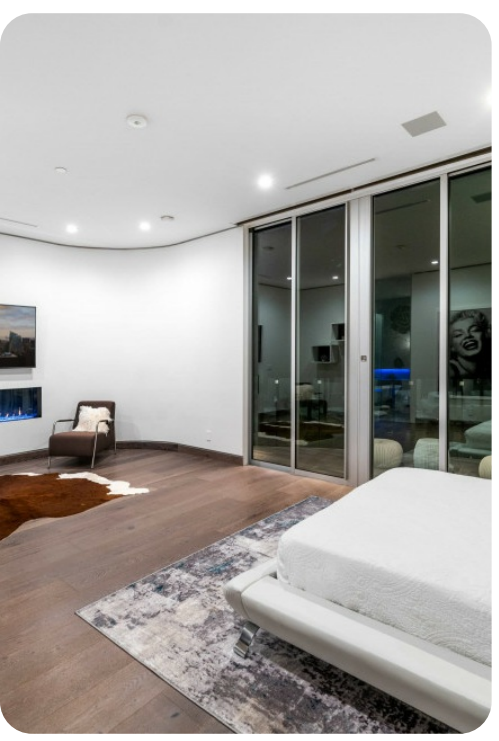
Los Angeles 164 | Page 7 of 8