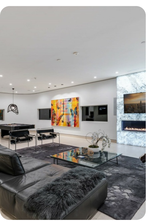
Los Angeles 164 | Page 5 of 8