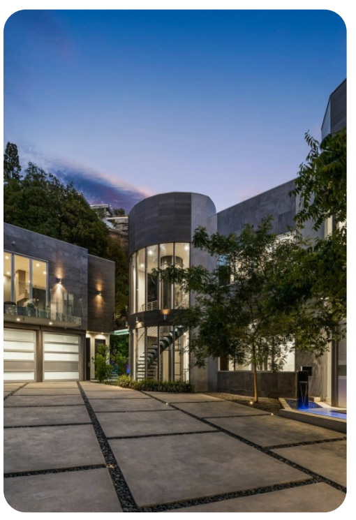
Los Angeles 164 | Page 8 of 8