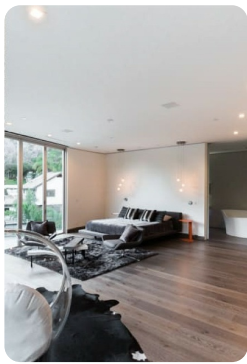
Los Angeles 164 | Page 3 of 8