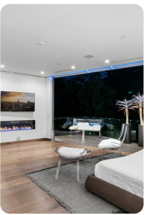
Los Angeles 164 | Page 6 of 8