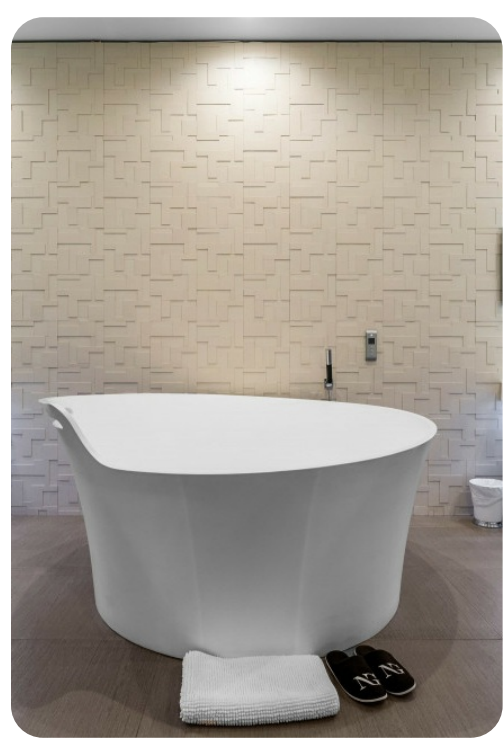
Los Angeles 164 | Page 2 of 8