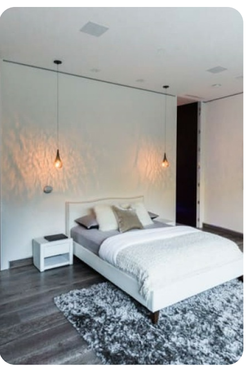
Los Angeles 164 | Page 4 of 8