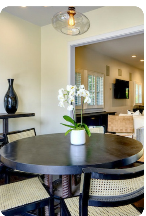
Los Angeles 1 | Page 5 of 7