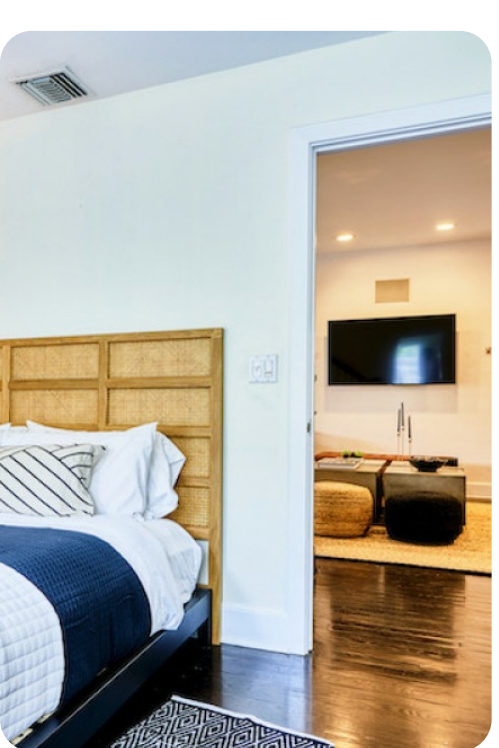
Los Angeles 1 | Page 6 of 7