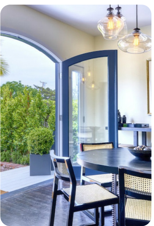
Los Angeles 1 | Page 4 of 7