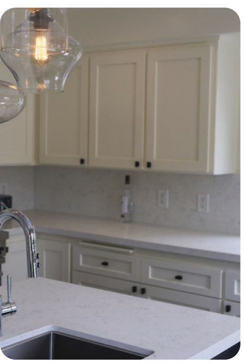
Los Angeles 1 | Page 3 of 7