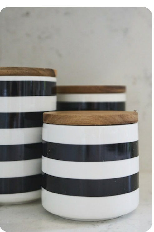
Los Angeles 1 | Page 2 of 7