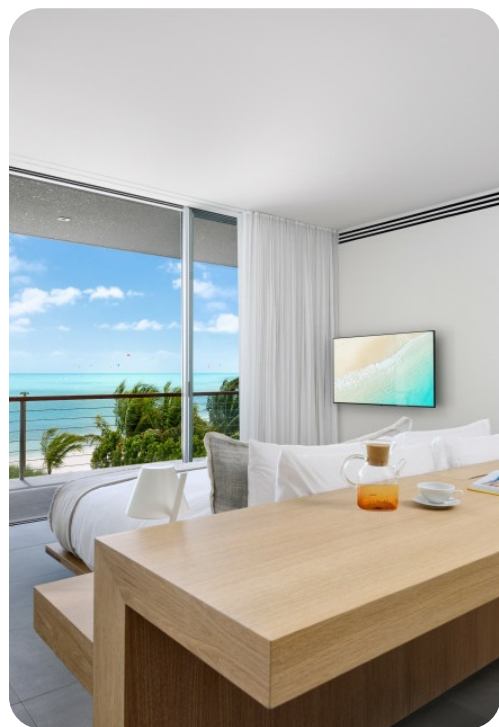
Long Bay Beach Enclave Beach House 4 - 2-bed | Page 2 of 5