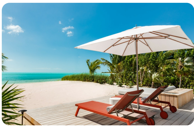
Long Bay Beach Enclave Beach House 4 - 2-bed | Page 1 of 5