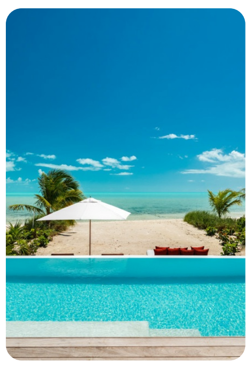
Long Bay Beach Enclave Beach House 4 - 2-bed | Page 4 of 5