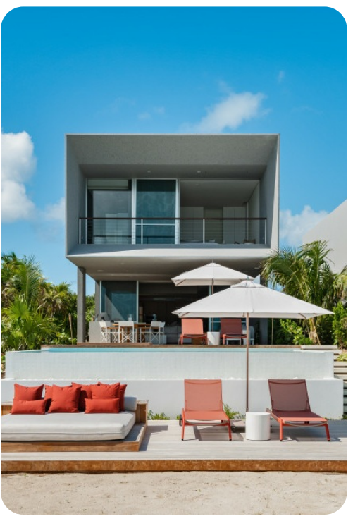
Long Bay Beach Enclave Beach House 4 - 2-bed | Page 5 of 5