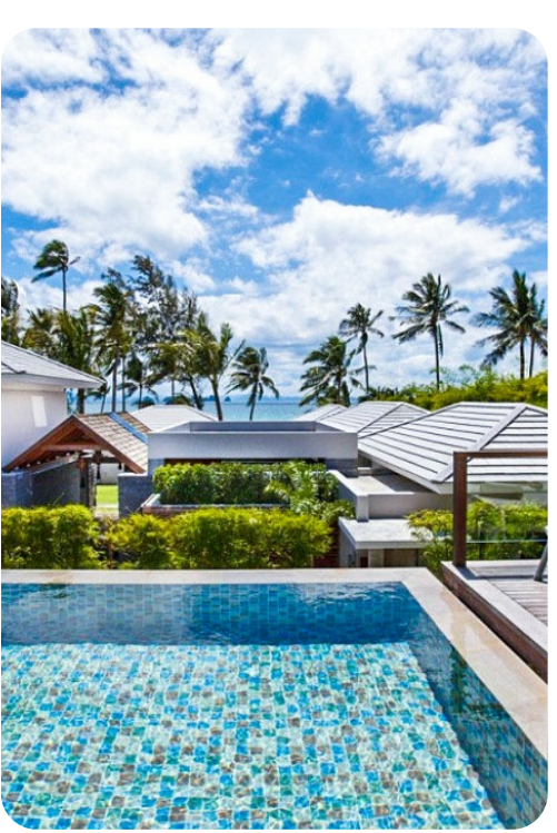
Lipa Noi 8032 | Page 2 of 8