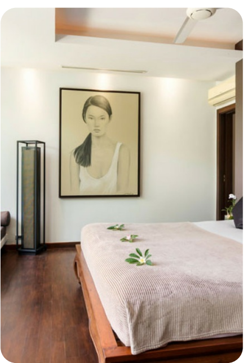
Lipa Noi 8032 | Page 8 of 8