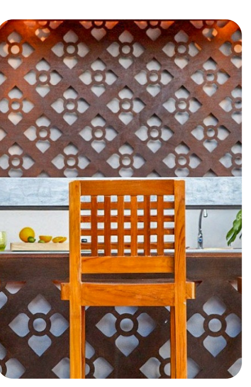
Lipa Noi 8032 | Page 6 of 8