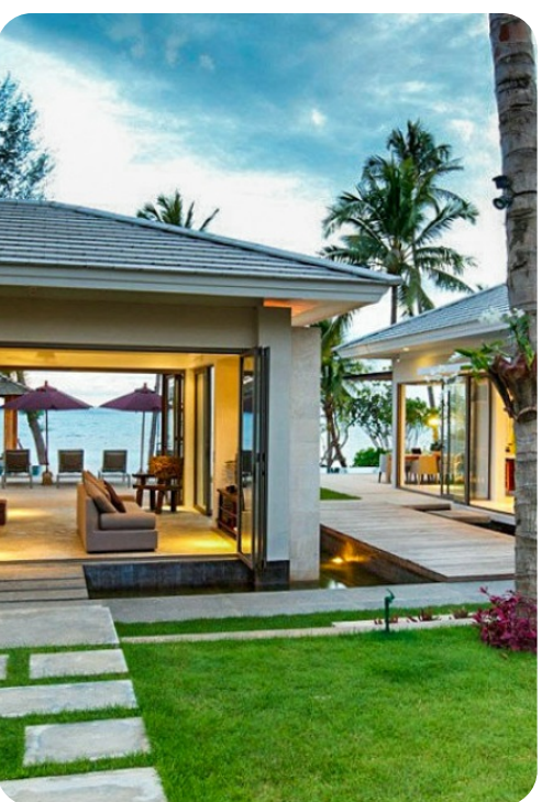
Lipa Noi 8032 | Page 4 of 8