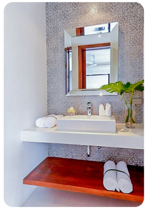
Lipa Noi 8032 | Page 5 of 8