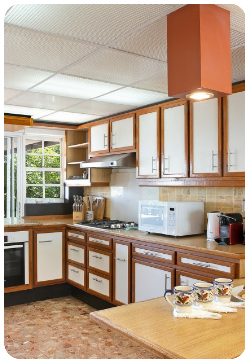
Les Zephyrs | Page 4 of 8