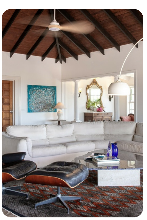
Les Zephyrs | Page 2 of 8