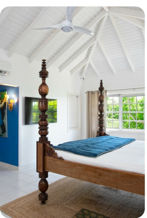
Les Zephyrs | Page 6 of 8