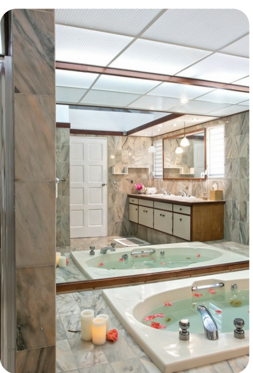
Les Zephyrs | Page 7 of 8