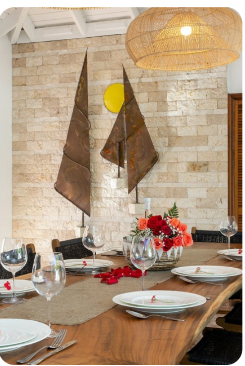
Les Zephyrs | Page 5 of 8