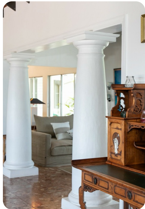
Les Zephyrs | Page 3 of 8