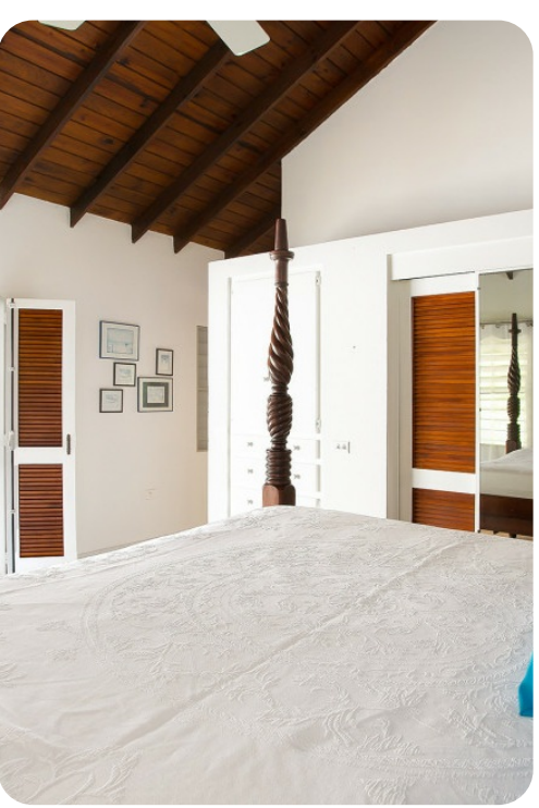
Les Zephyrs | Page 8 of 8