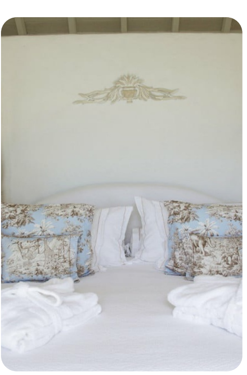
Les Amis du Vent | Page 4 of 8