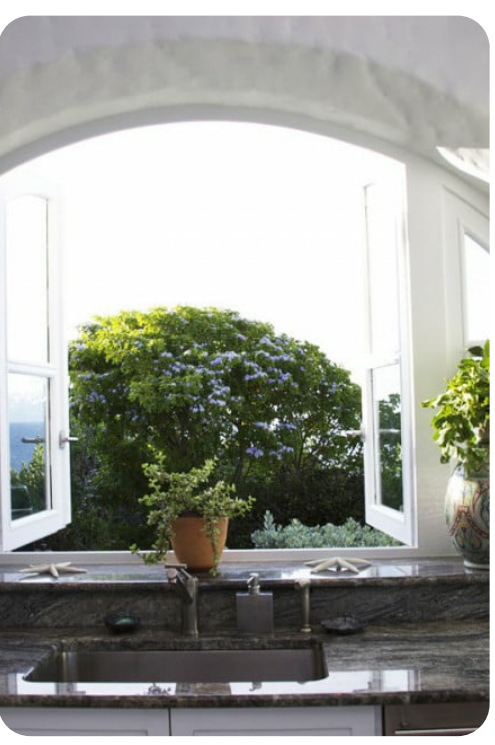
Les Amis du Vent | Page 3 of 8