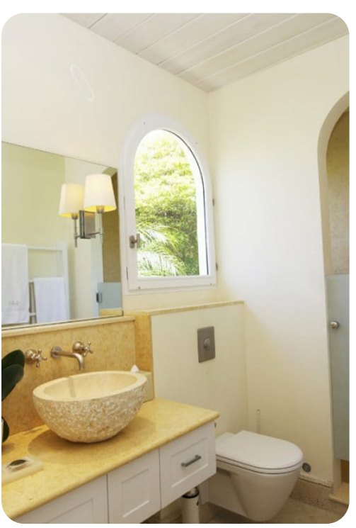
Les Amis du Vent | Page 5 of 8