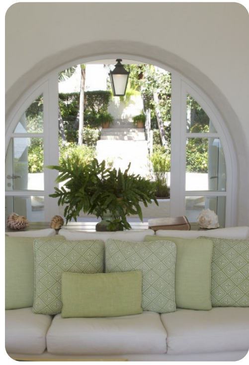
Les Amis du Vent | Page 2 of 8