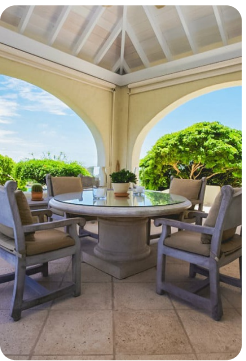
Les Amis du Vent | Page 6 of 8