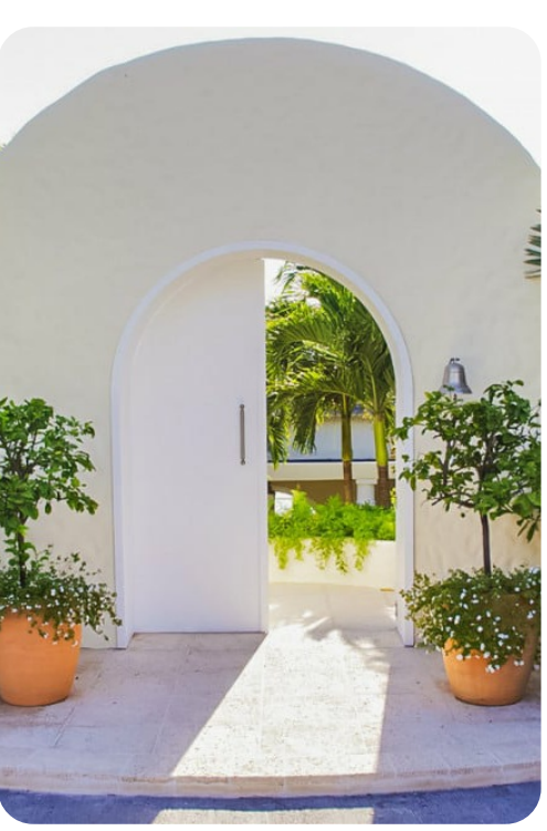
Les Amis du Vent | Page 7 of 8