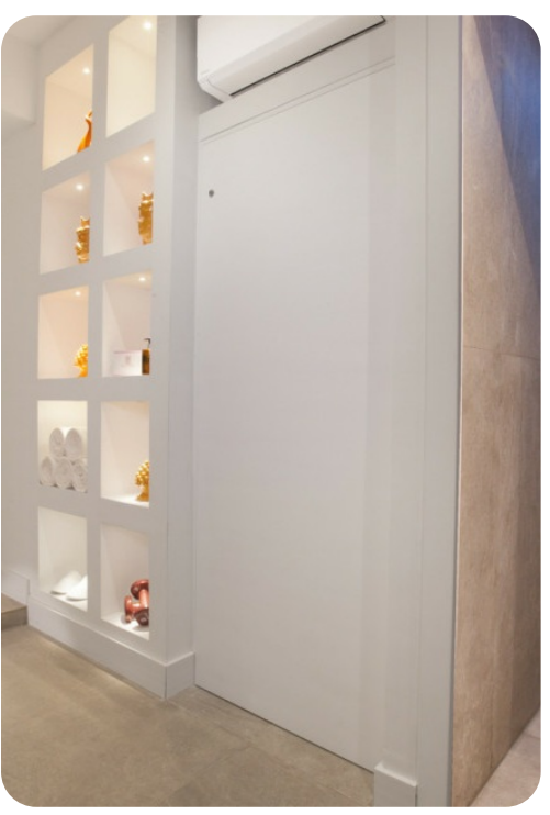
Le Palme | Page 7 of 8