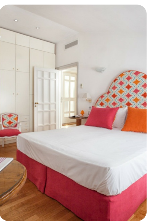
Le Palme | Page 5 of 8