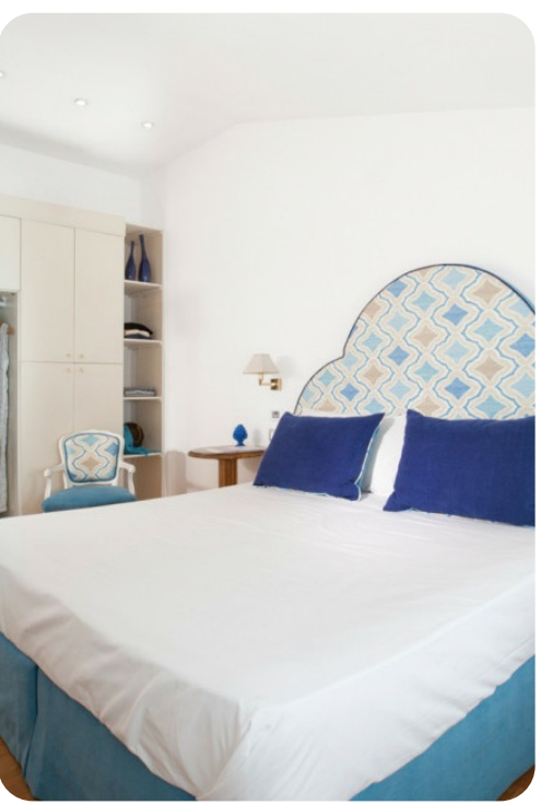
Le Palme | Page 6 of 8