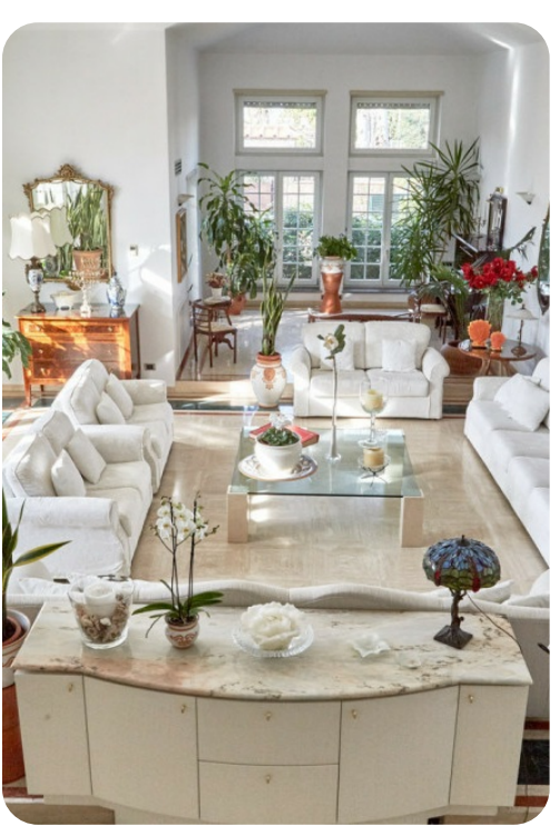
Le Palme | Page 2 of 8