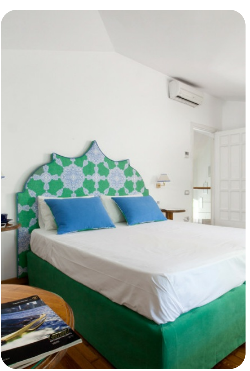
Le Palme | Page 4 of 8