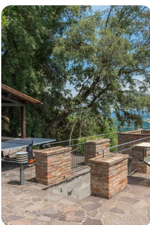
L Alcova | Page 2 of 8