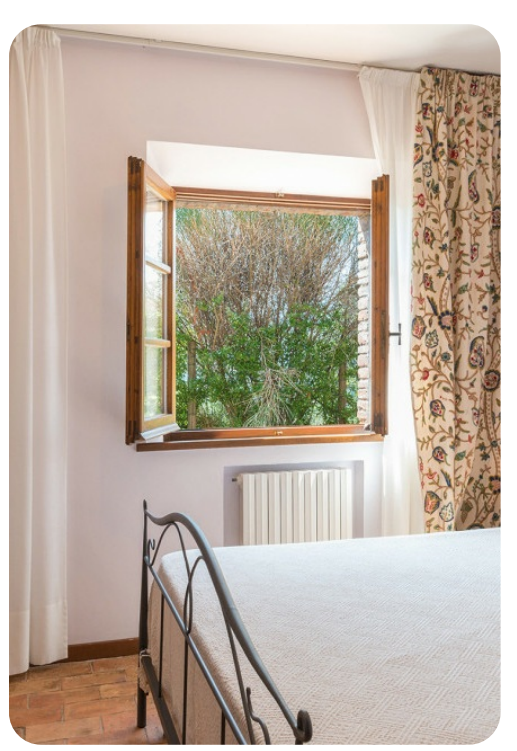
L Alcova | Page 7 of 8