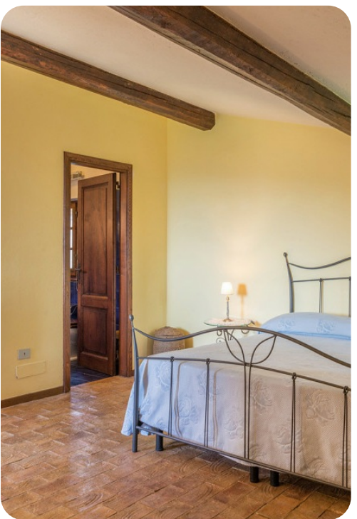
L Alcova | Page 6 of 8