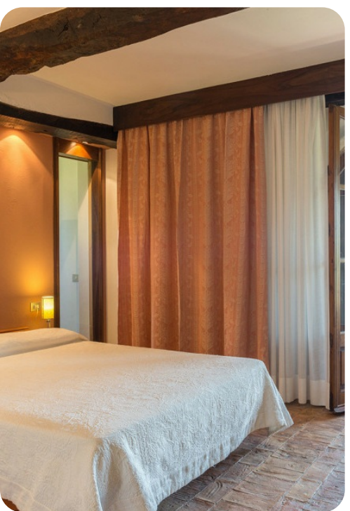
L Alcova | Page 5 of 8