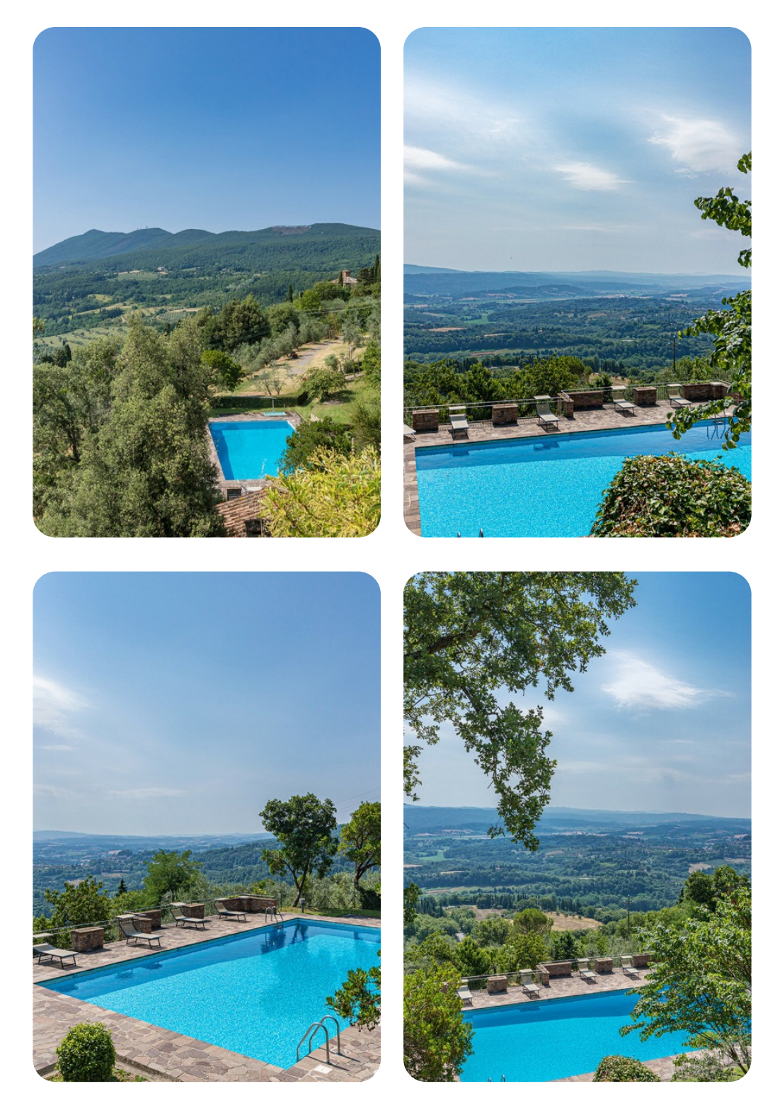
L Alcova | Page 8 of 8