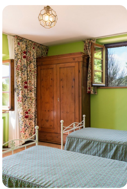
L Alcova | Page 4 of 8