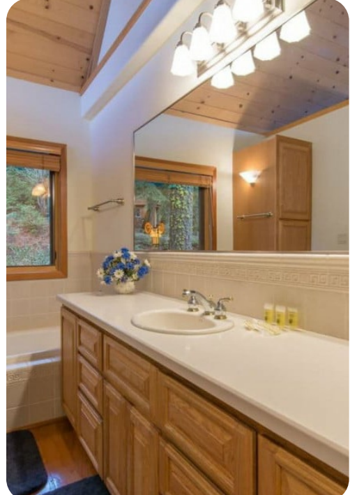
Lake Tahoe 96 | Page 3 of 6