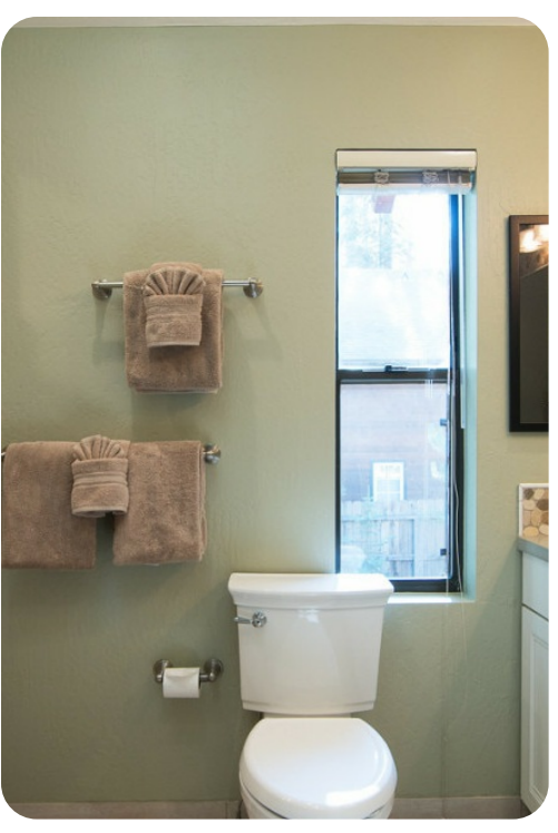
Lake Tahoe 9 | Page 4 of 8