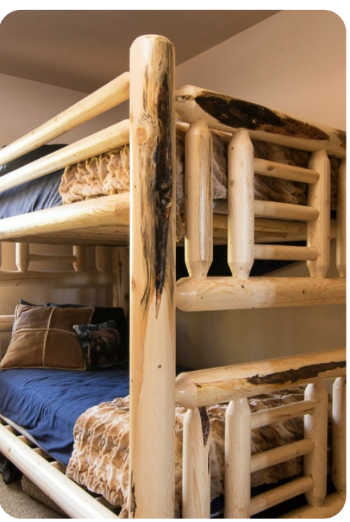
Lake Tahoe 9 | Page 6 of 8