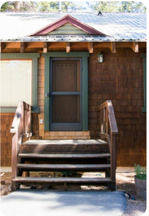
Lake Tahoe 9 | Page 7 of 8