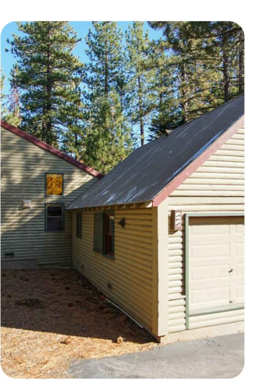
Lake Tahoe 9 | Page 8 of 8