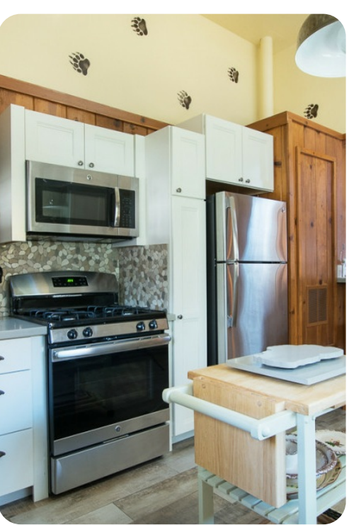
Lake Tahoe 9 | Page 3 of 8