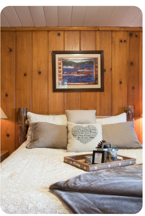
Lake Tahoe 9 | Page 5 of 8