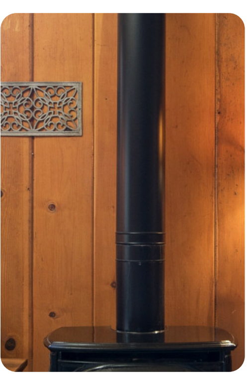
Lake Tahoe 9 | Page 2 of 8