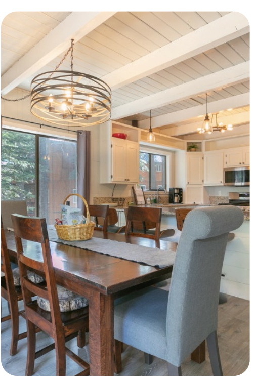
Lake Tahoe 8 | Page 3 of 8