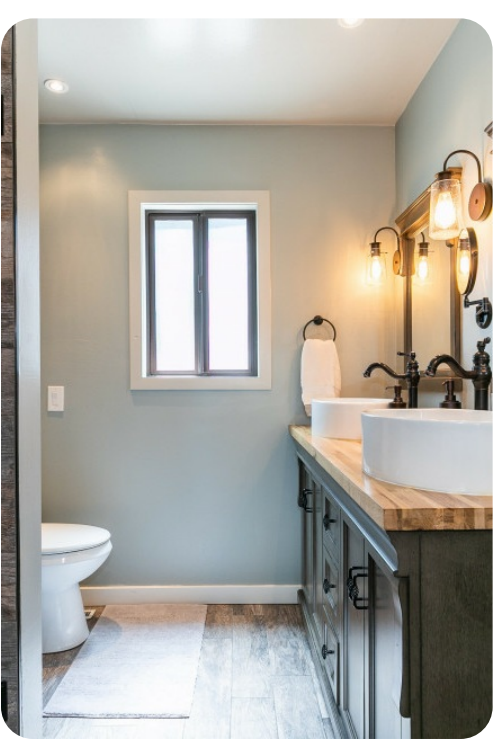
Lake Tahoe 8 | Page 5 of 8