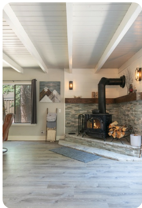
Lake Tahoe 8 | Page 2 of 8