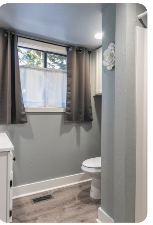
Lake Tahoe 8 | Page 4 of 8