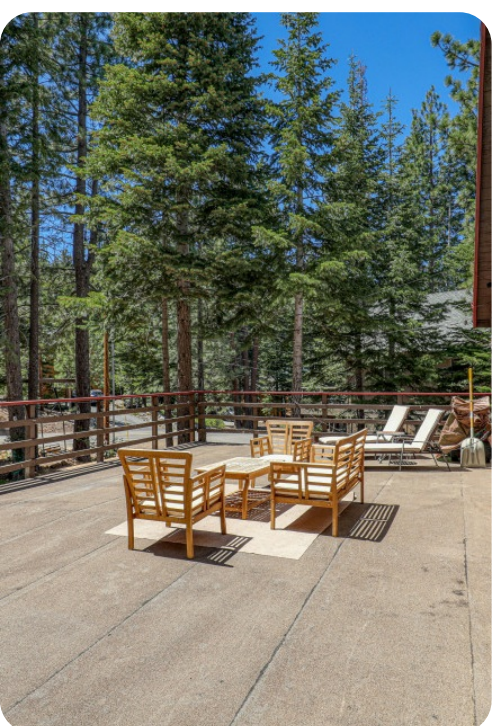
Lake Tahoe 8 | Page 7 of 8