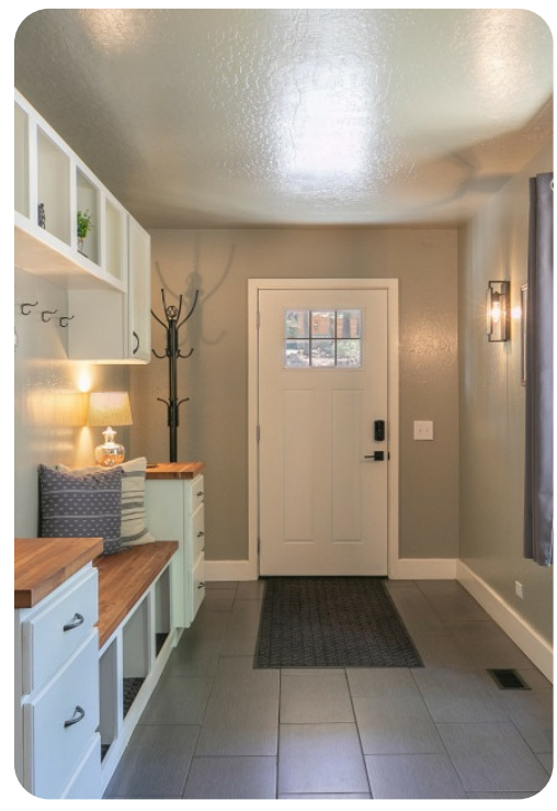
Lake Tahoe 8 | Page 6 of 8