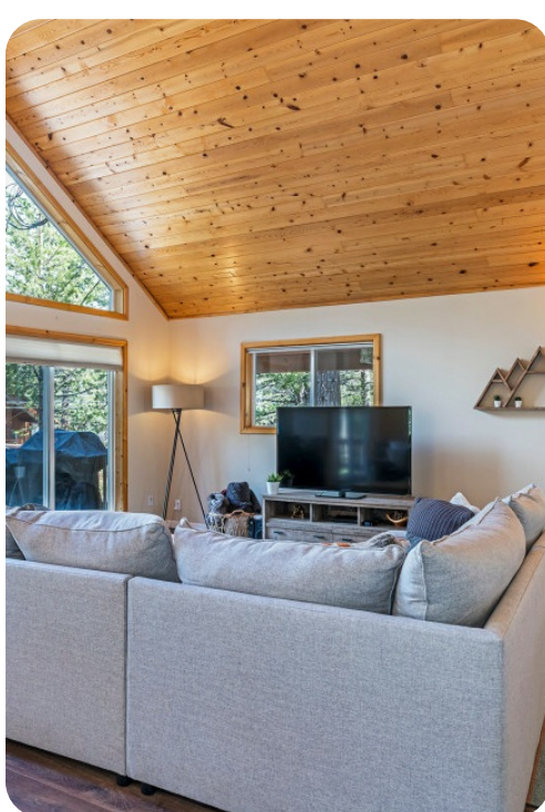
Lake Tahoe 39 | Page 2 of 6