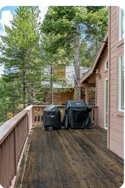
Lake Tahoe 39 | Page 5 of 6