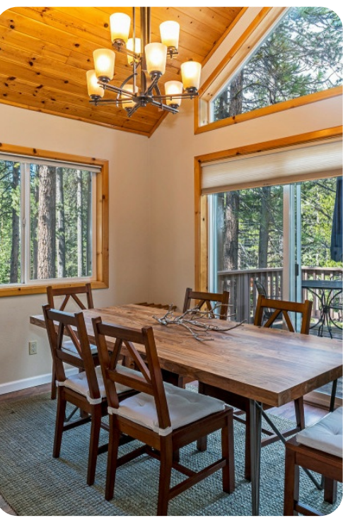
Lake Tahoe 39 | Page 3 of 6