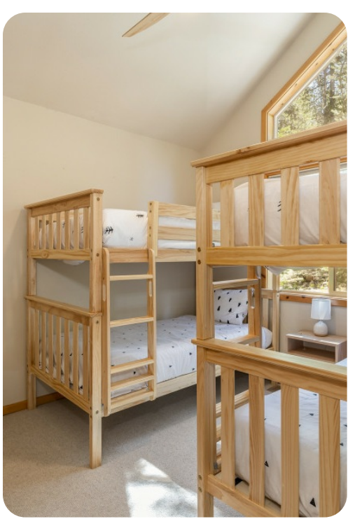
Lake Tahoe 39 | Page 4 of 6