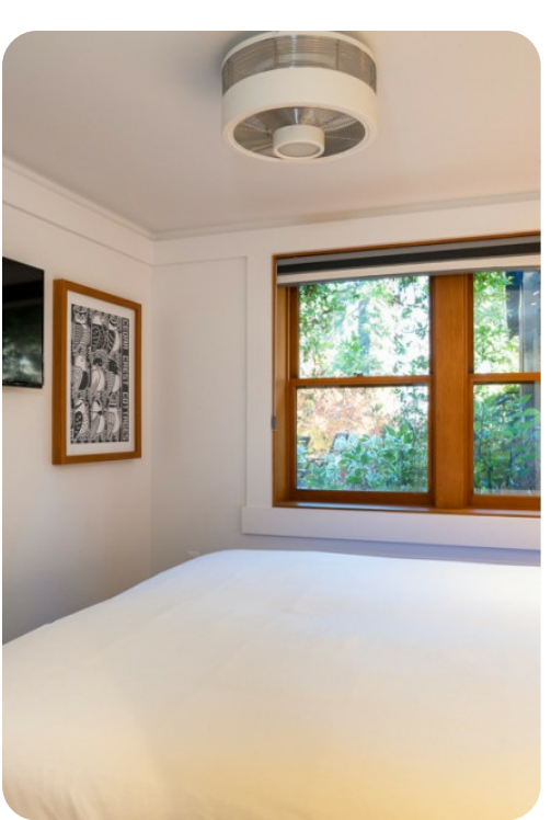
Lake Tahoe 24 | Page 4 of 7