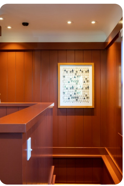
Lake Tahoe 24 | Page 6 of 7