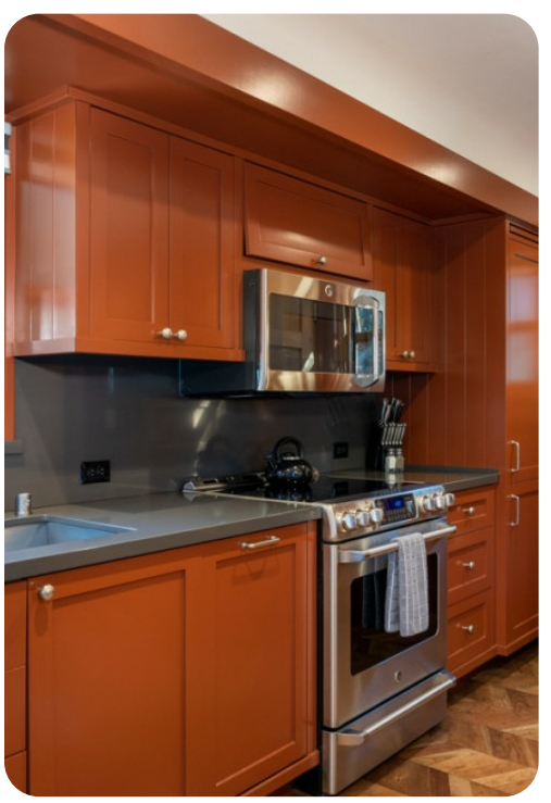
Lake Tahoe 24 | Page 3 of 7