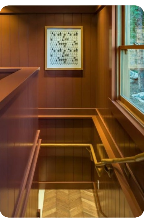
Lake Tahoe 24 | Page 2 of 7