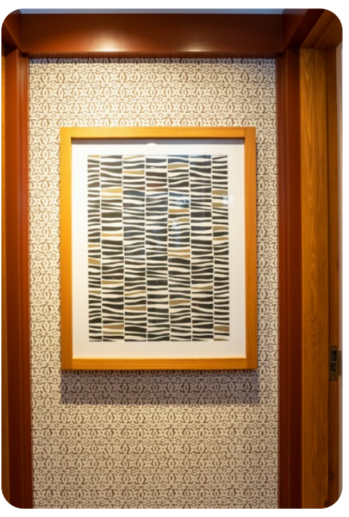
Lake Tahoe 24 | Page 5 of 7