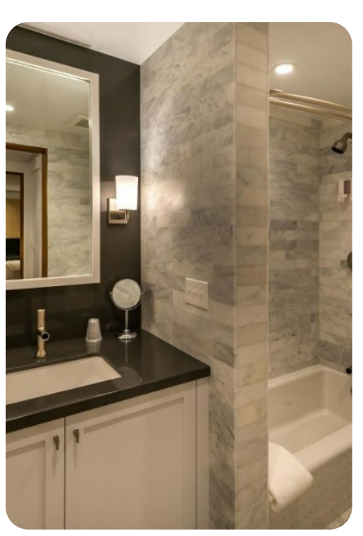
Lake Tahoe 22 | Page 2 of 3