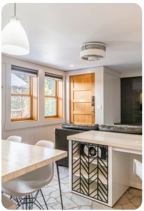
Lake Tahoe 19 | Page 2 of 7