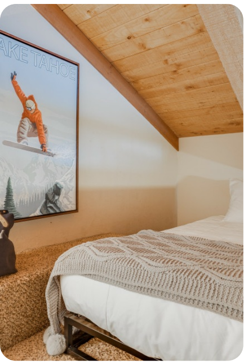
Lake Tahoe 130 | Page 4 of 8