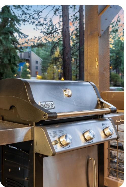
Lake Tahoe 130 | Page 6 of 8