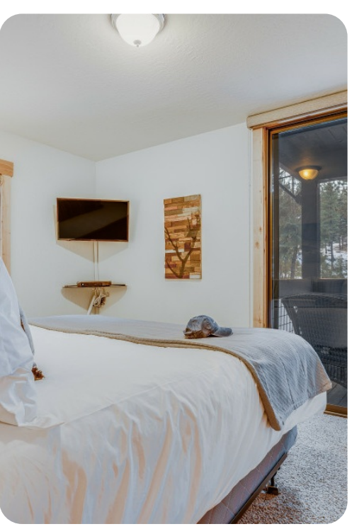
Lake Tahoe 130 | Page 5 of 8