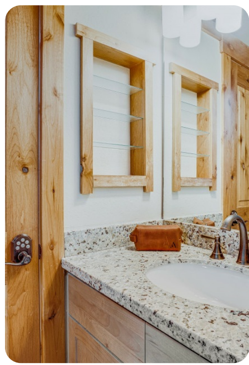
Lake Tahoe 130 | Page 3 of 8