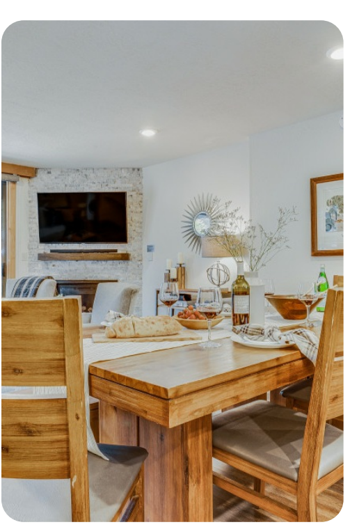
Lake Tahoe 130 | Page 2 of 8