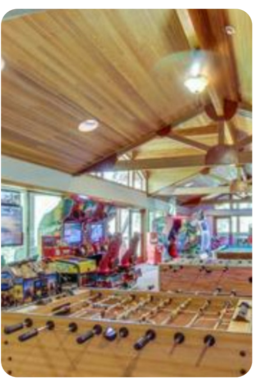
Lake Tahoe 130 | Page 7 of 8