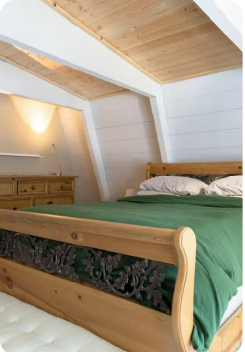
Lake Tahoe 126 | Page 3 of 7