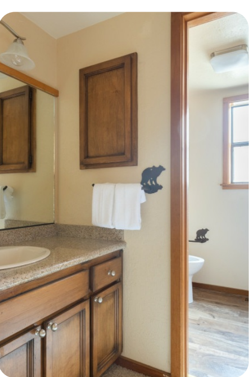
Lake Tahoe 118 | Page 5 of 8