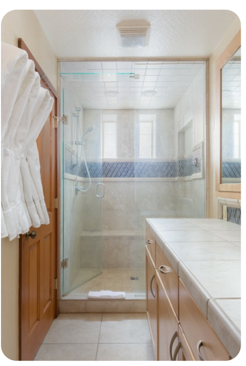
Lake Tahoe 118 | Page 6 of 8