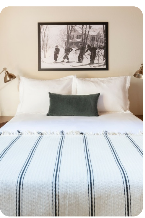
Lake Tahoe 118 | Page 4 of 8