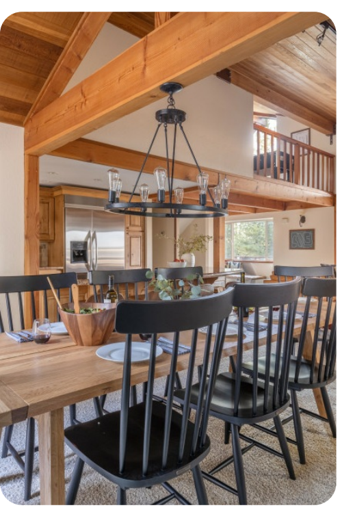
Lake Tahoe 118 | Page 2 of 8