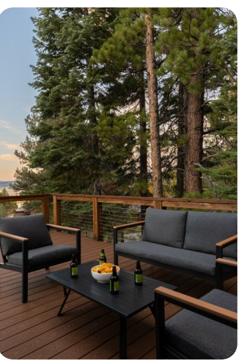
Lake Tahoe 118 | Page 7 of 8