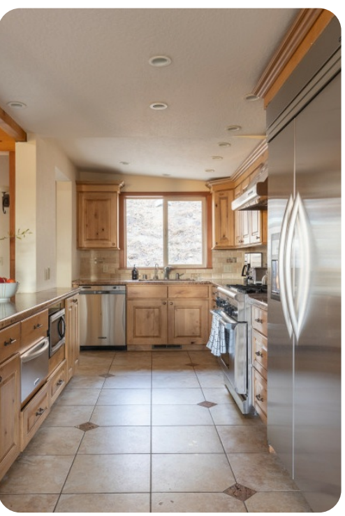
Lake Tahoe 118 | Page 3 of 8