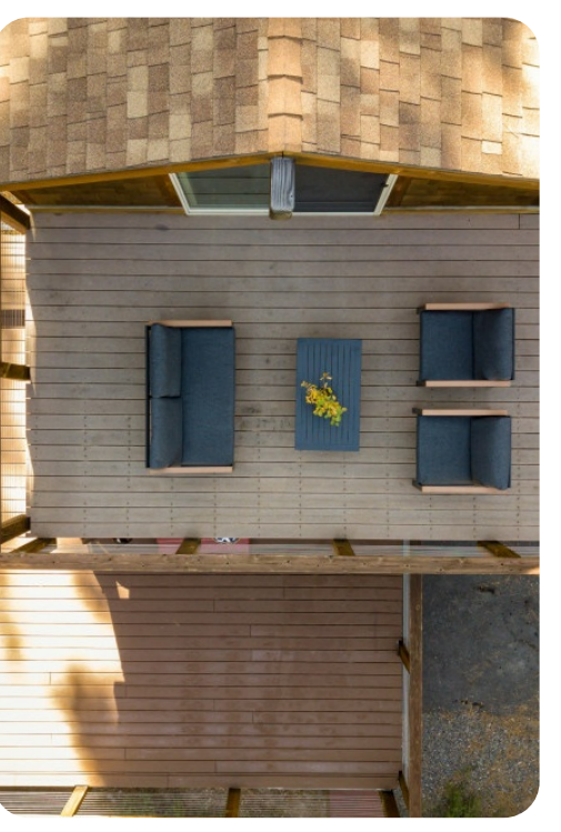
Lake Tahoe 118 | Page 8 of 8