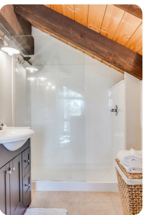
Lake Tahoe 112 | Page 4 of 7