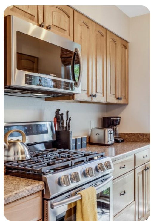
Lake Tahoe 112 | Page 3 of 7