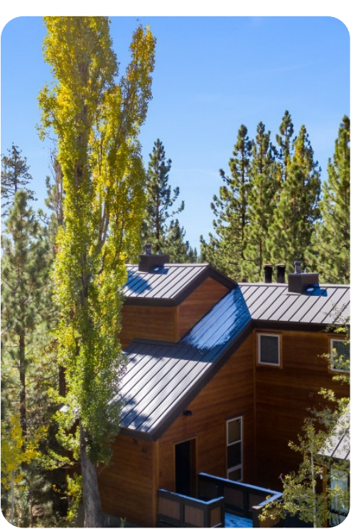
Lake Tahoe 112 | Page 6 of 7