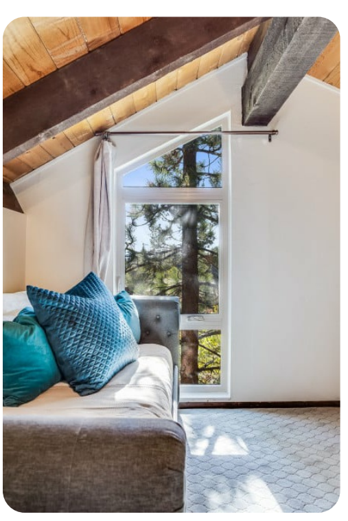
Lake Tahoe 112 | Page 5 of 7