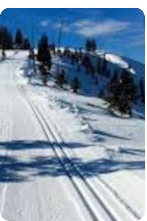
Lake Tahoe 109 | Page 5 of 7