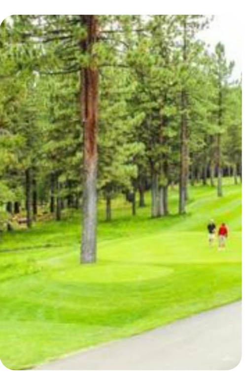
Lake Tahoe 109 | Page 6 of 7