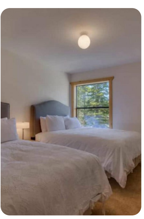
Lake Tahoe 109 | Page 4 of 7