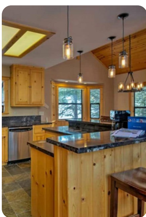
Lake Tahoe 109 | Page 2 of 7