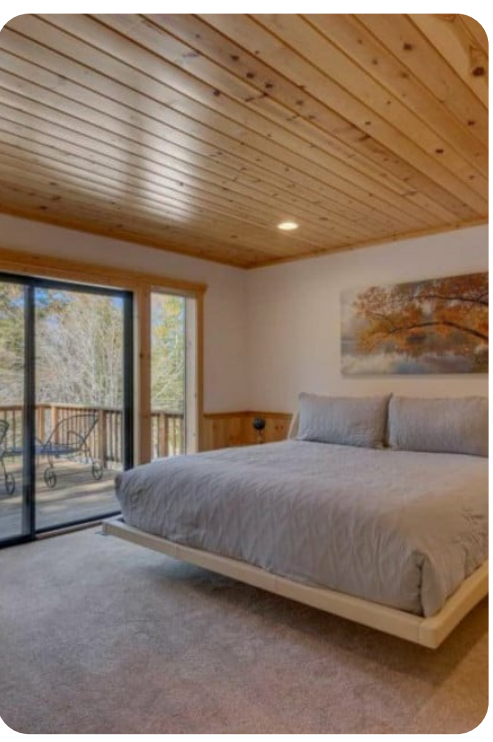
Lake Tahoe 109 | Page 3 of 7