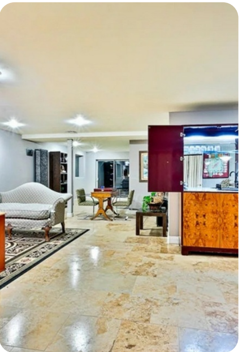
La Jolla 10 | Page 3 of 8