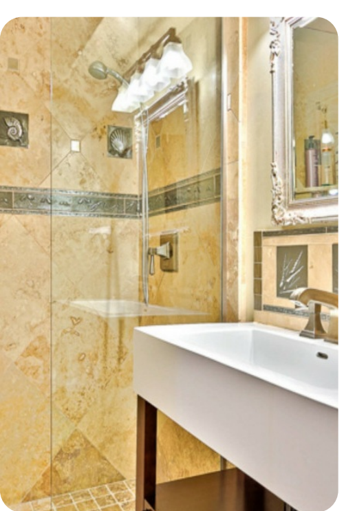
La Jolla 10 | Page 8 of 8