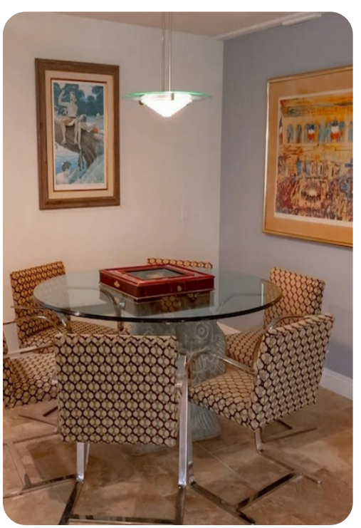
La Jolla 10 | Page 5 of 8