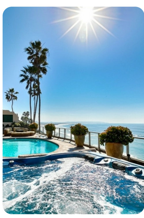
La Jolla 10 | Page 2 of 8