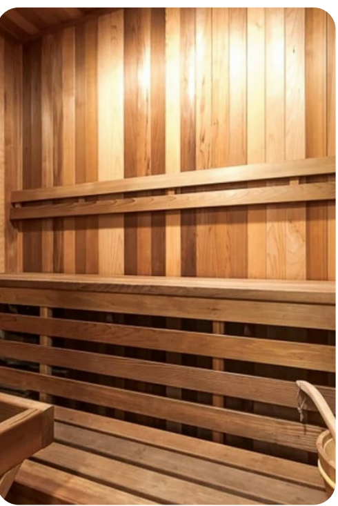
La Jolla 10 | Page 6 of 8