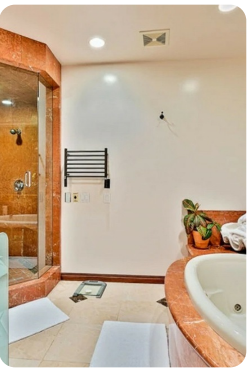
La Jolla 10 | Page 7 of 8