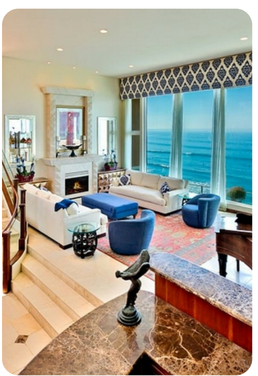
La Jolla 10 | Page 4 of 8