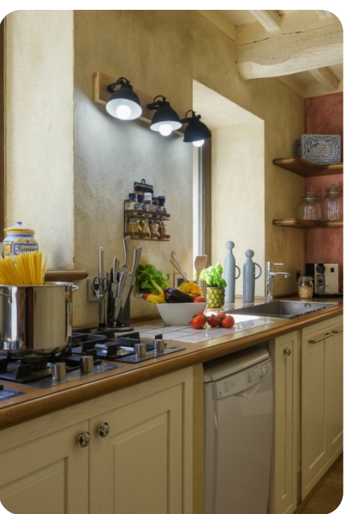
La Dama Del Bosco | Page 4 of 8