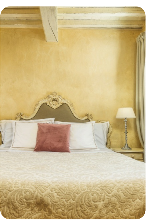
La Dama Del Bosco | Page 8 of 8