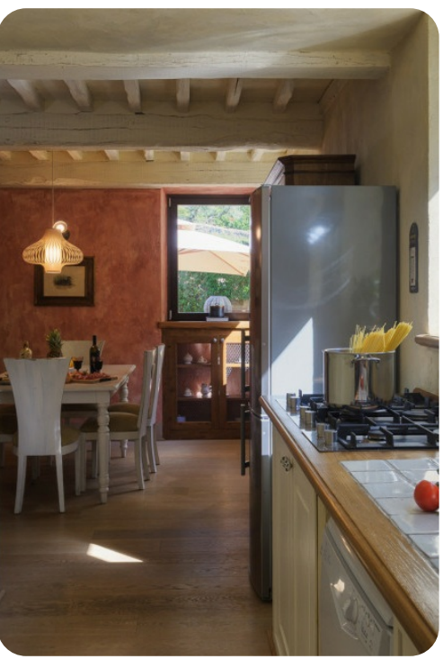
La Dama Del Bosco | Page 7 of 8