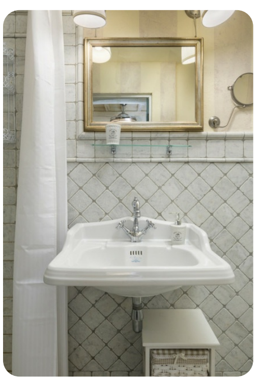
La Dama Del Bosco | Page 6 of 8