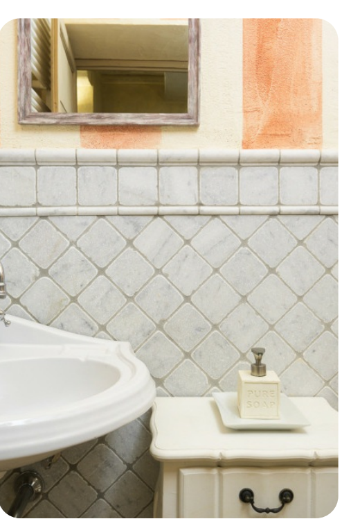
La Dama Del Bosco | Page 5 of 8