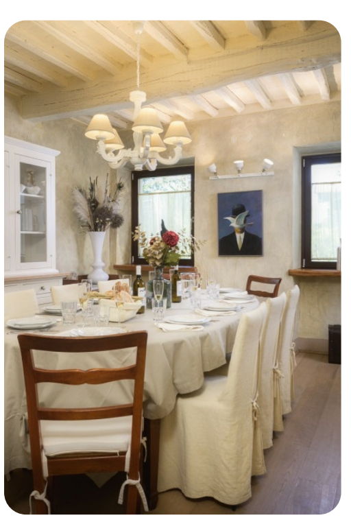
La Dama Del Bosco | Page 3 of 8