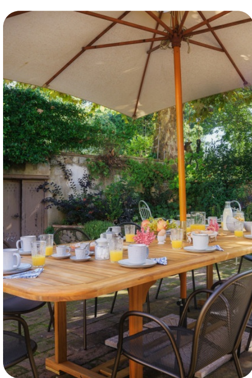
La Dama Del Bosco | Page 2 of 8