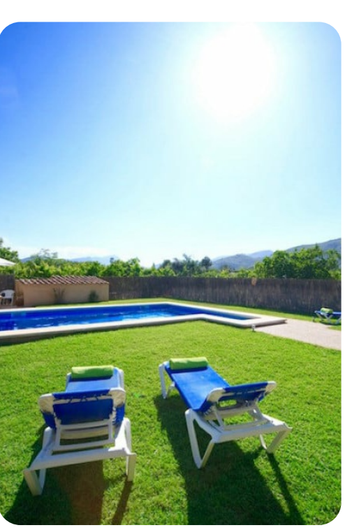
La Casita | Page 5 of 6