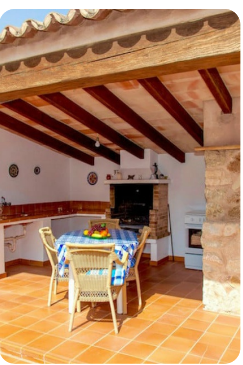
La Casita | Page 4 of 6