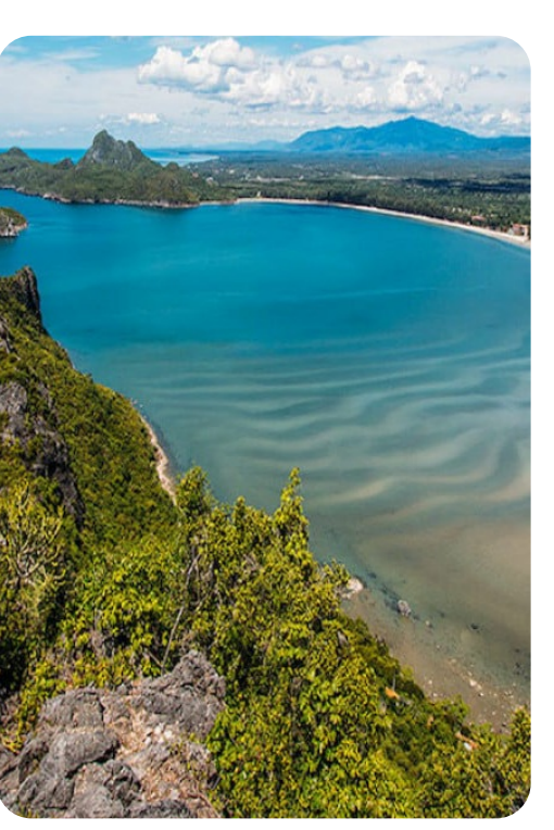
La Casita | Page 6 of 6