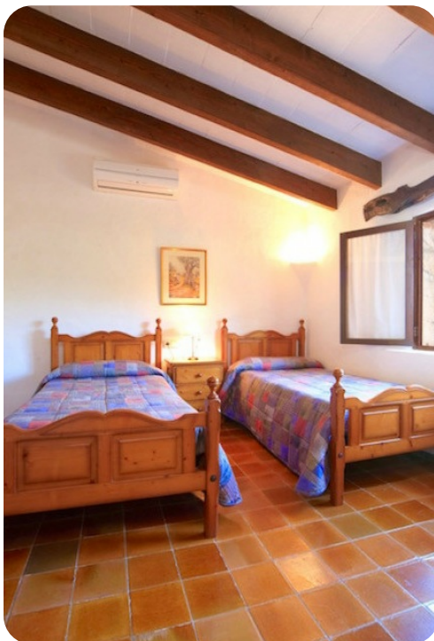
La Casita | Page 2 of 6