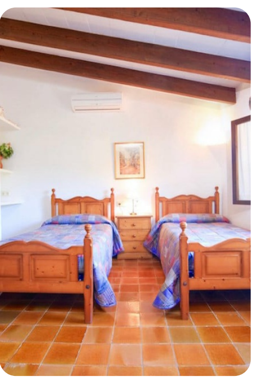
La Casita | Page 3 of 6