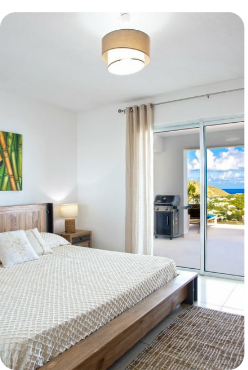
La Casa del Jefe | Page 5 of 8