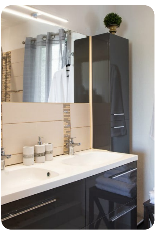
La Casa del Jefe | Page 6 of 8