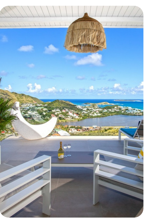
La Casa del Jefe | Page 8 of 8