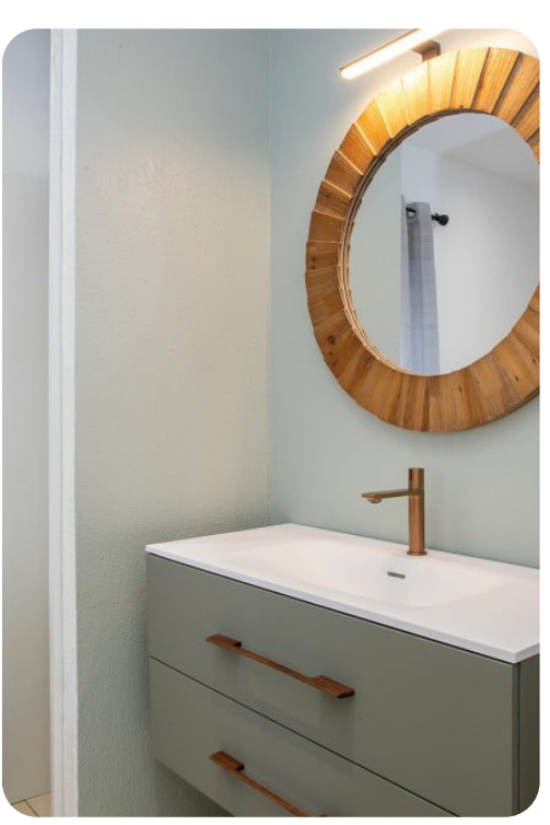
La Casa del Jefe | Page 7 of 8