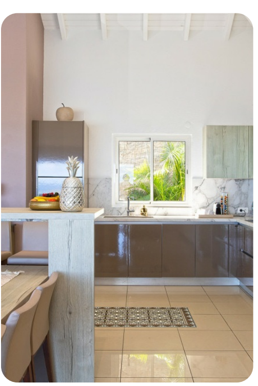
La Casa del Jefe | Page 3 of 8