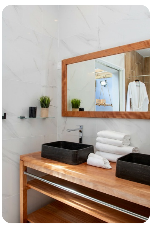
La Casa del Jefe | Page 4 of 8