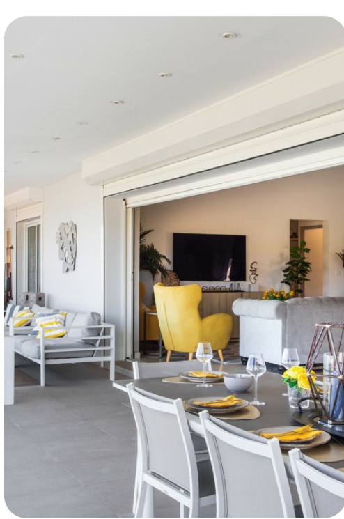
La Casa del Jefe | Page 2 of 8