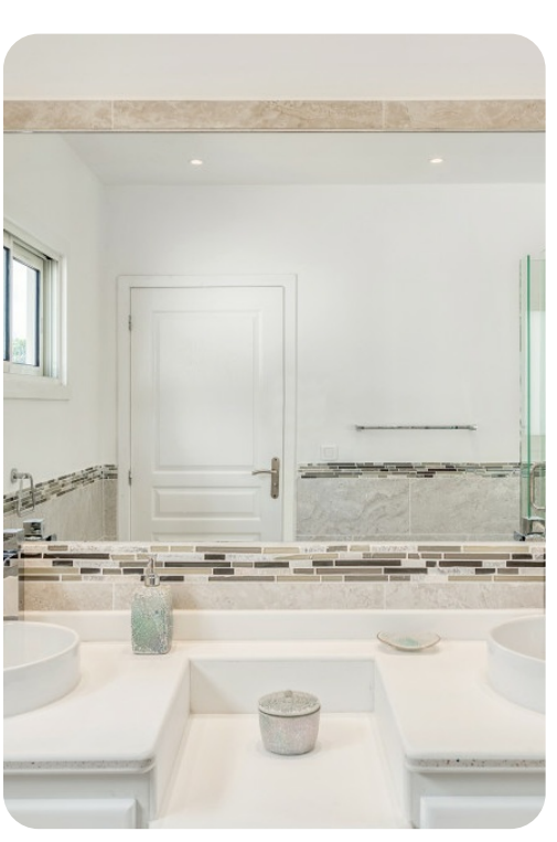
La Bella Casa | Page 3 of 8