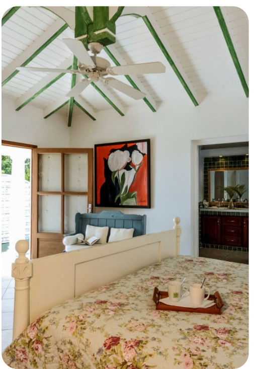
La Bella Casa | Page 5 of 8