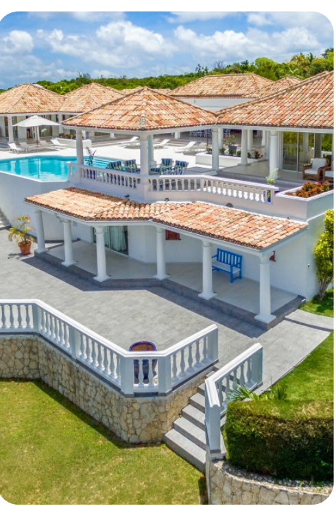
La Bella Casa | Page 8 of 8