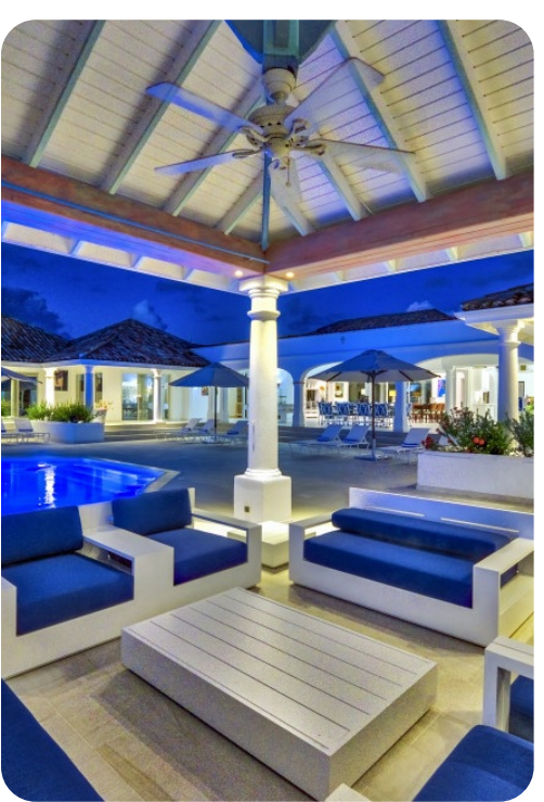
La Bella Casa | Page 7 of 8