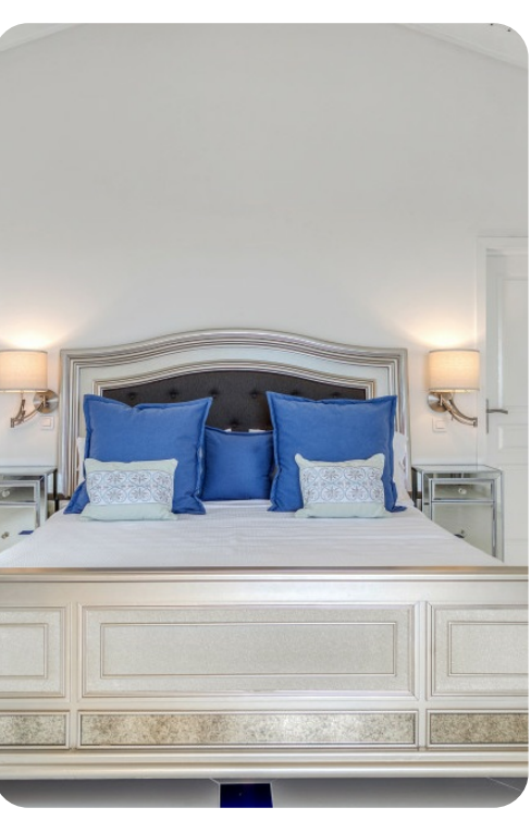
La Bella Casa | Page 2 of 8