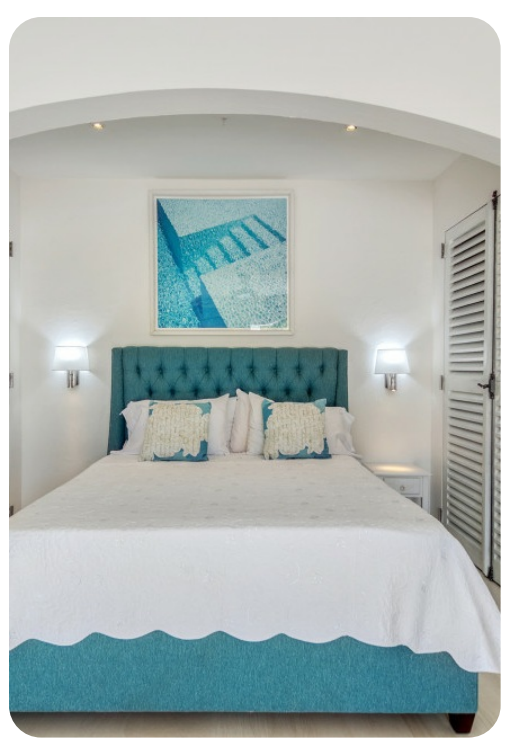
La Bella Casa | Page 4 of 8