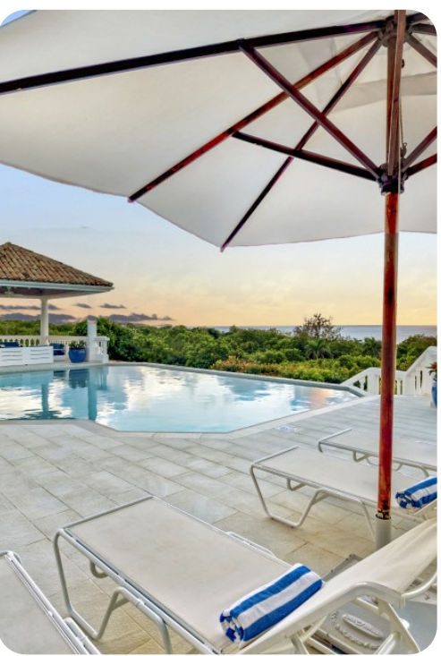
La Bella Casa | Page 6 of 8