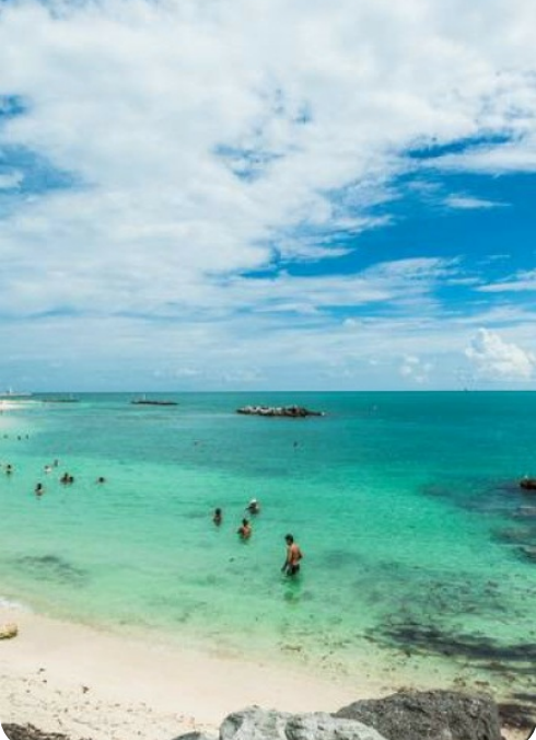
Key West 18 | Page 7 of 8