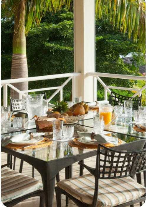
Jus Paradise Golf Villa in Rose Hall | Page 4 of 8