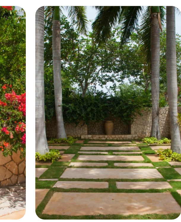
Jus Paradise Golf Villa in Rose Hall | Page 7 of 8