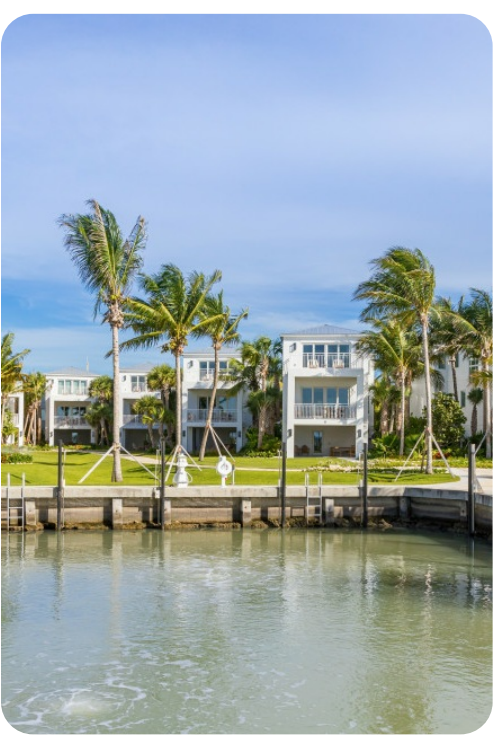
Islamorada Waterfront Villa 1 | Page 6 of 8