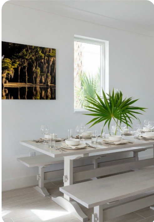
Islamorada Waterfront Villa 1 | Page 2 of 8