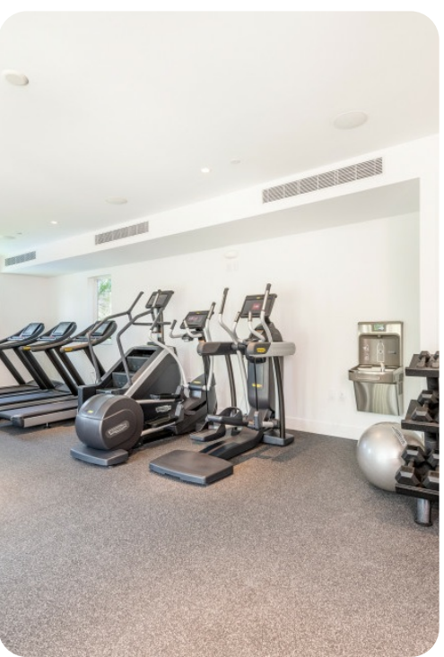
Islamorada Waterfront Villa 1 | Page 5 of 8