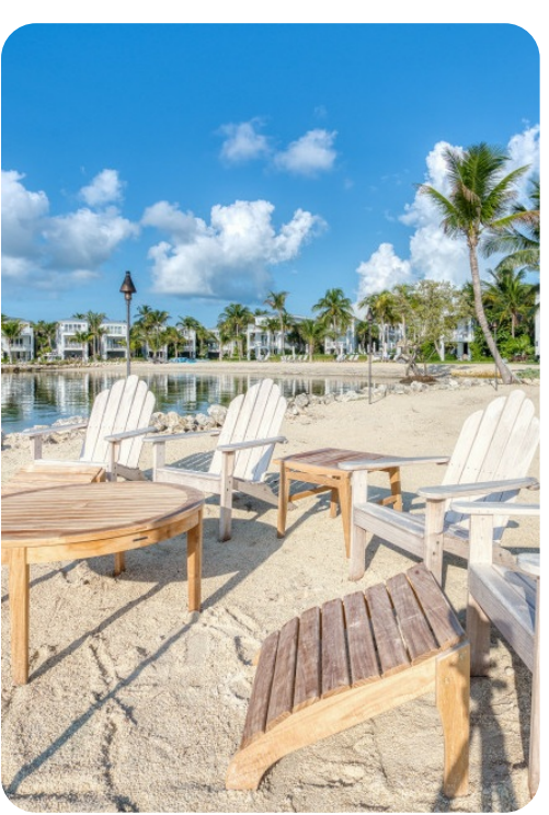
Islamorada Waterfront Villa 1 | Page 7 of 8