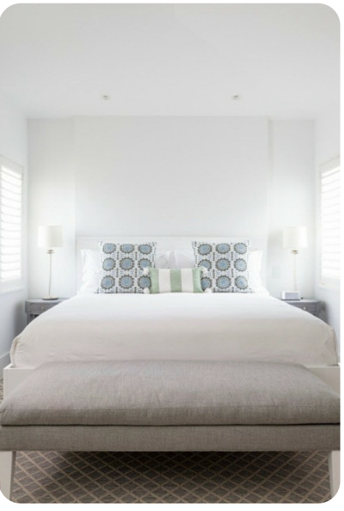
Islamorada Waterfront Villa 1 | Page 3 of 8