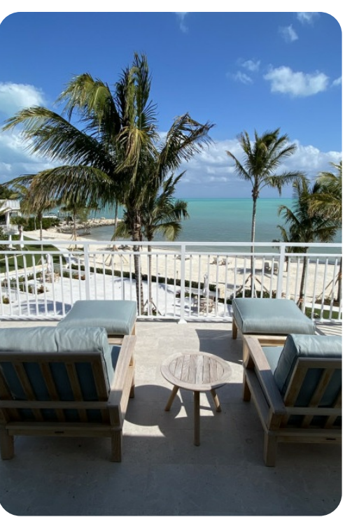
Islamorada Waterfront Villa 1 | Page 4 of 8