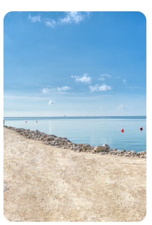
Islamorada Waterfront Villa 1 | Page 8 of 8