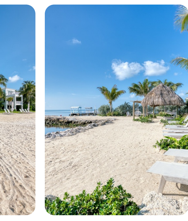
Islamorada Premium Villa 2 - Bunk Beds | Page 8 of 8