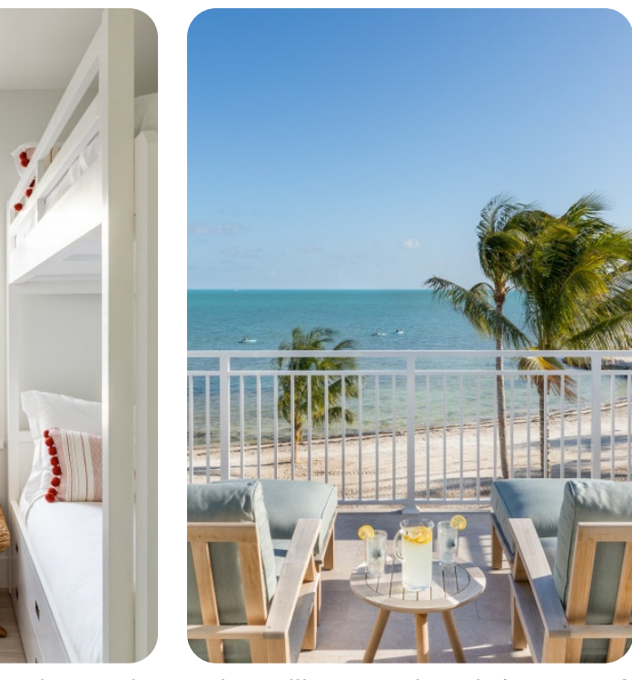
Islamorada Premium Villa 2 - Bunk Beds | Page 4 of 8