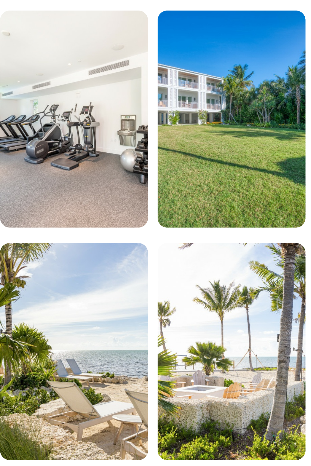
Islamorada Premium Villa 2 - Bunk Beds | Page 6 of 8