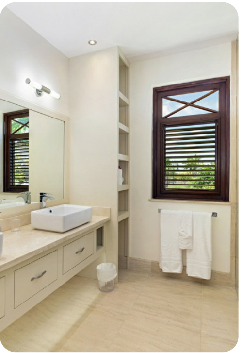
Infinity House | Page 8 of 8