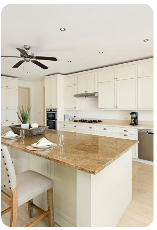
Infinity House | Page 4 of 8