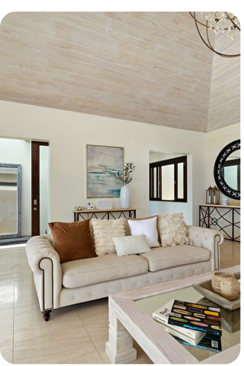
Infinity House | Page 3 of 8