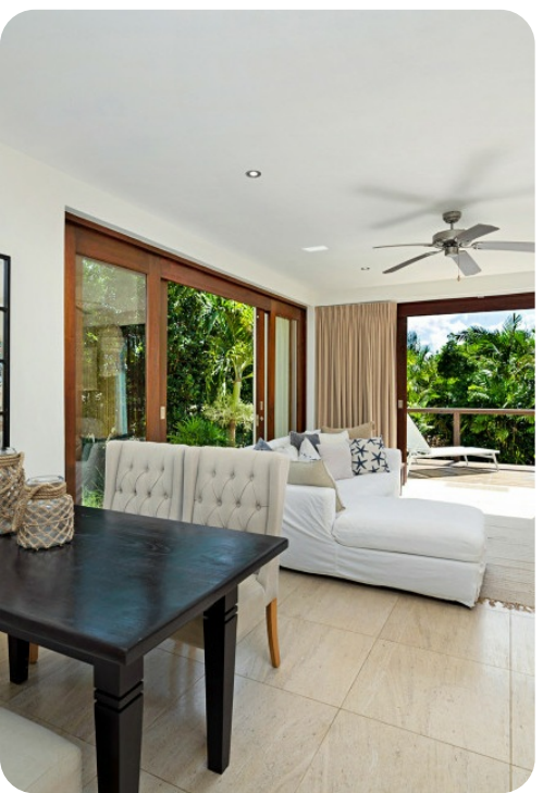
Infinity House | Page 6 of 8