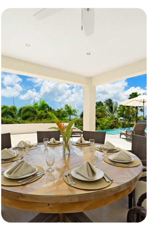
Infinity House | Page 7 of 8