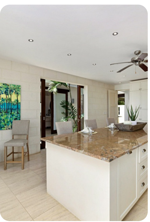
Infinity House | Page 5 of 8