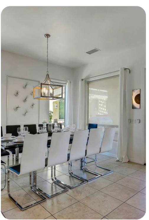
Indio 10 | Page 3 of 8