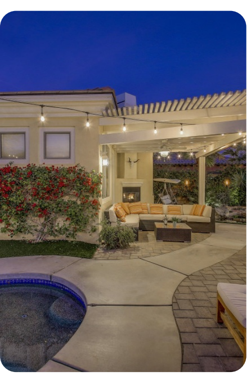
Indio 10 | Page 8 of 8