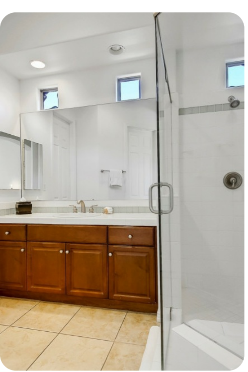
Indio 10 | Page 6 of 8