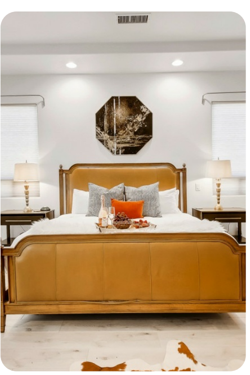
Indio 10 | Page 4 of 8