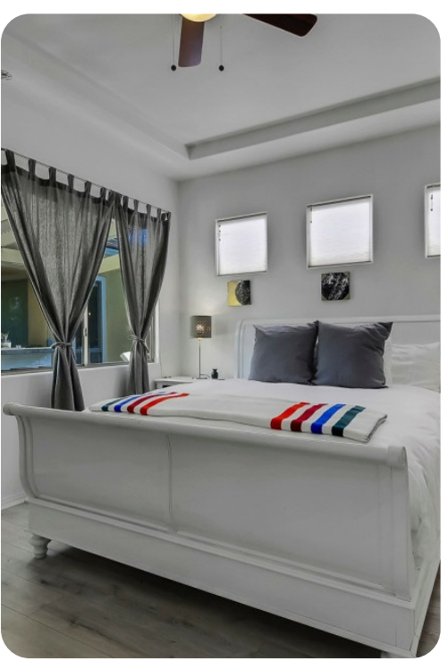
Indio 10 | Page 5 of 8