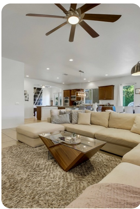
Indio 10 | Page 2 of 8