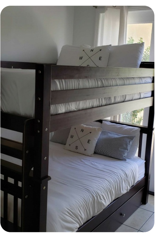
Indio 10 | Page 7 of 8