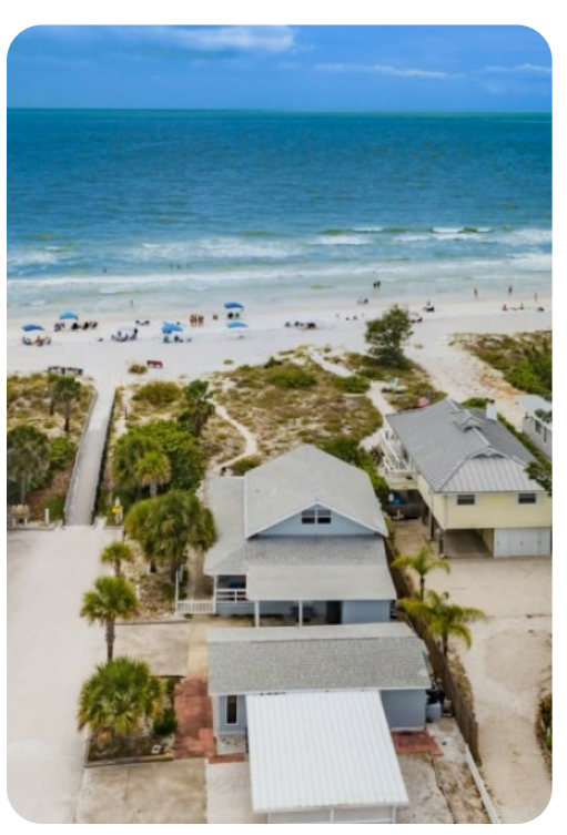
Indian Shores 3 | Page 5 of 6