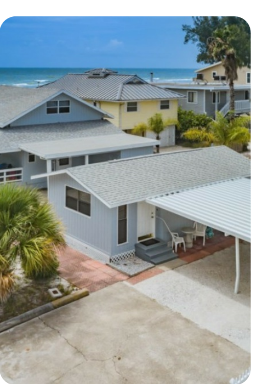
Indian Shores 3 | Page 6 of 6