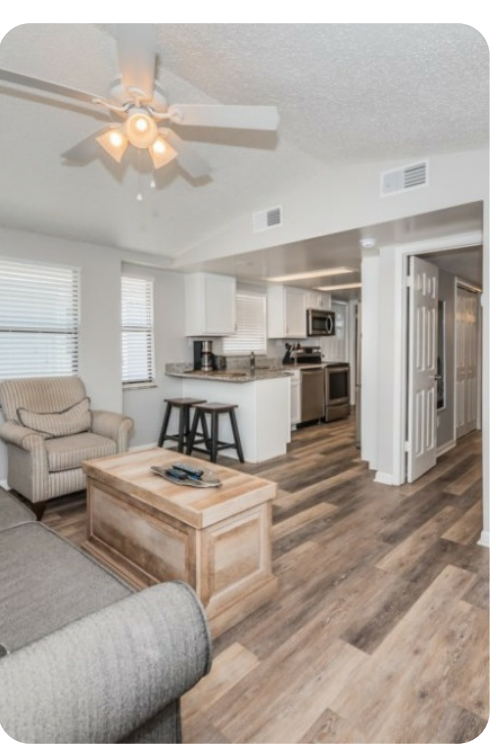
Indian Shores 3 | Page 2 of 6