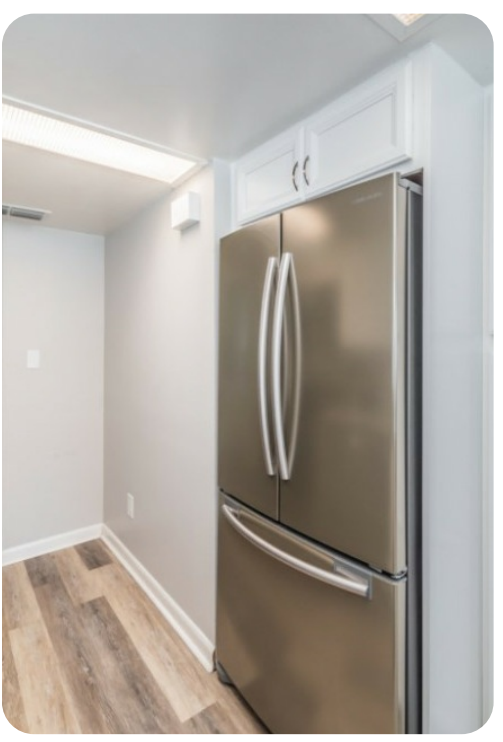
Indian Shores 3 | Page 3 of 6