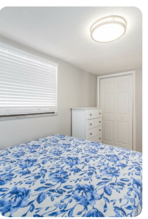
Indian Shores 3 | Page 4 of 6