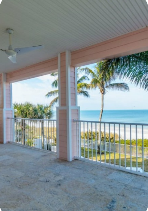
Indian Rocks Beach 4 | Page 4 of 8