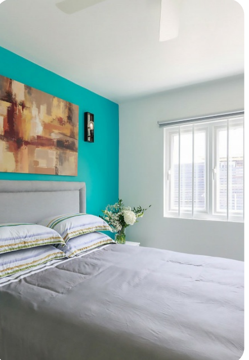
Imagine - St James | Page 4 of 6