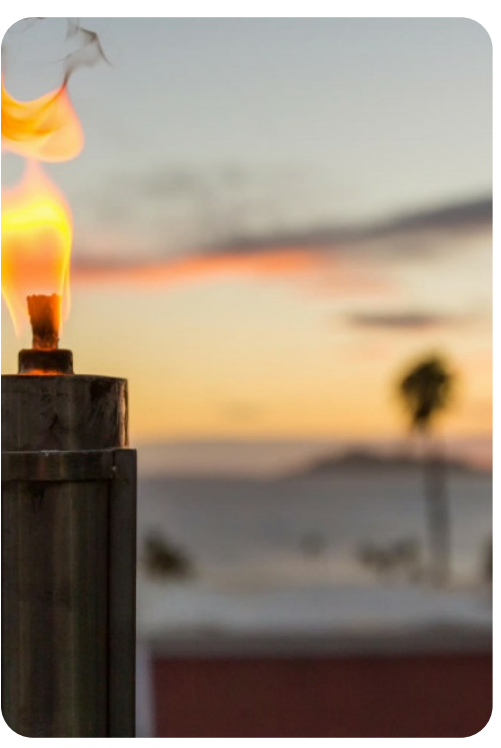
Honolulu 21 | Page 7 of 7