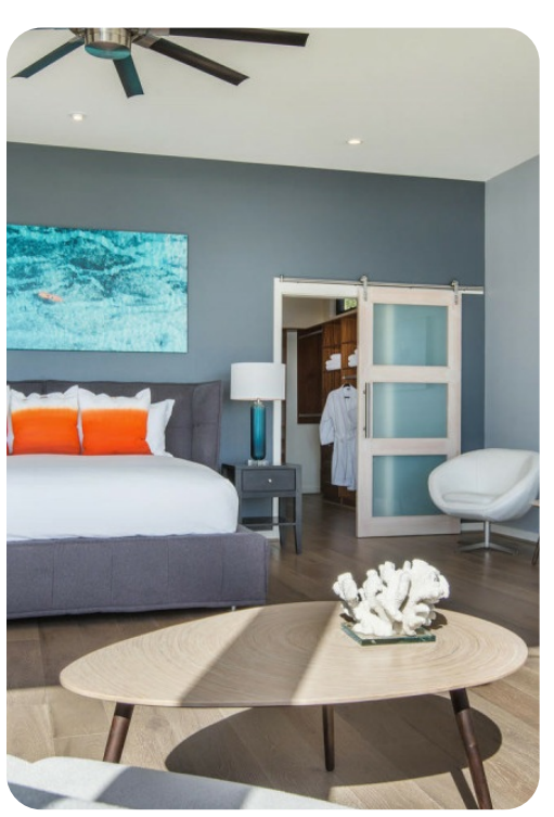
Honolulu 21 | Page 3 of 7