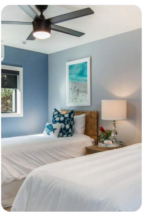
Honolulu 21 | Page 4 of 7