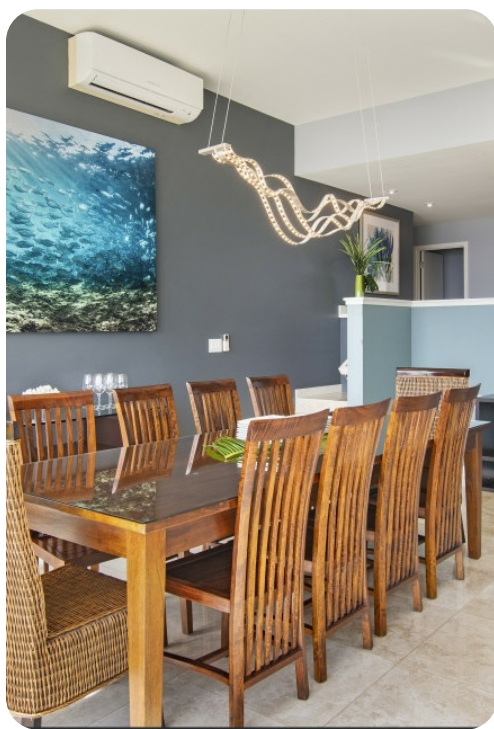
Honolulu 21 | Page 2 of 7