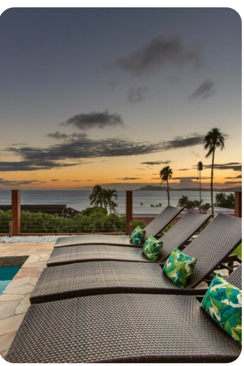
Honolulu 21 | Page 6 of 7