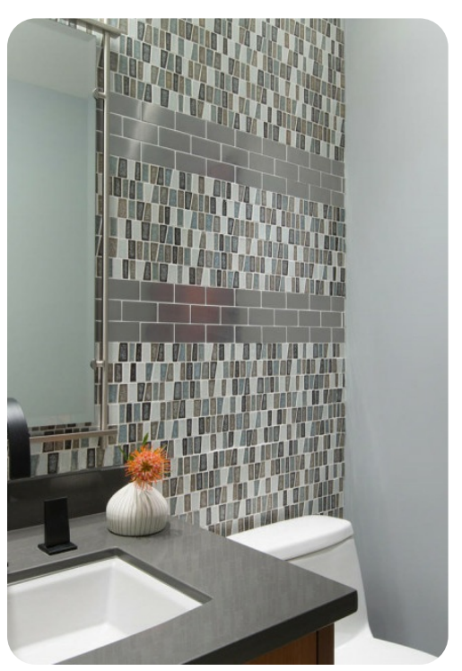
Honolulu 21 | Page 5 of 7