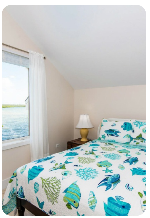
Hidden Cove | Page 6 of 8