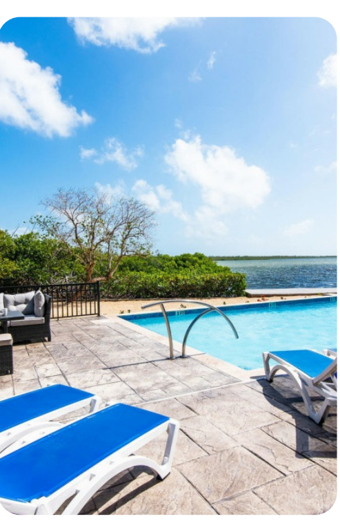
Hidden Cove | Page 8 of 8