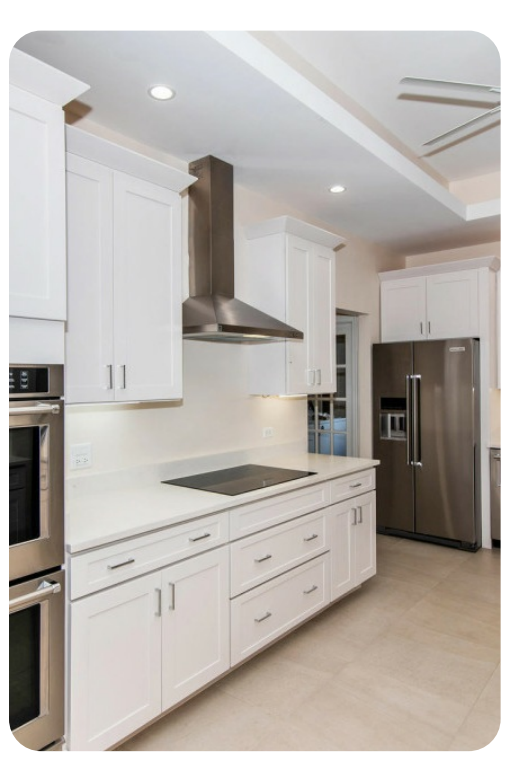
Hidden Cove | Page 3 of 8