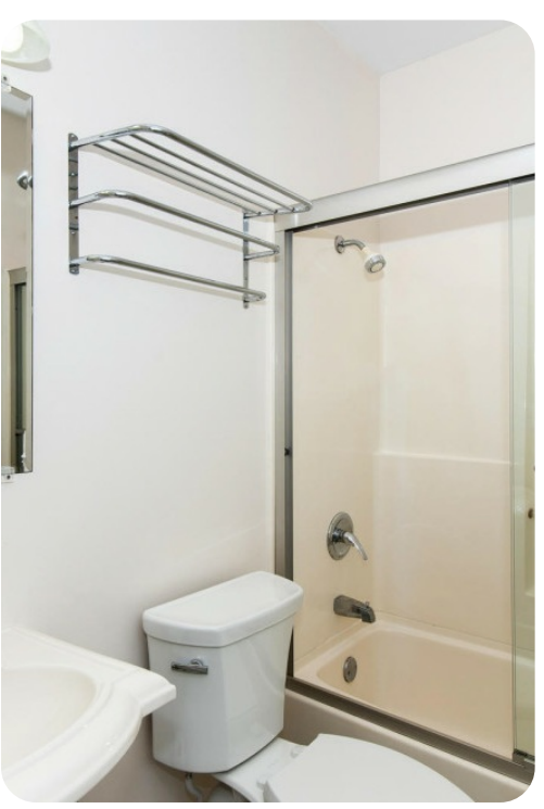
Hidden Cove | Page 5 of 8