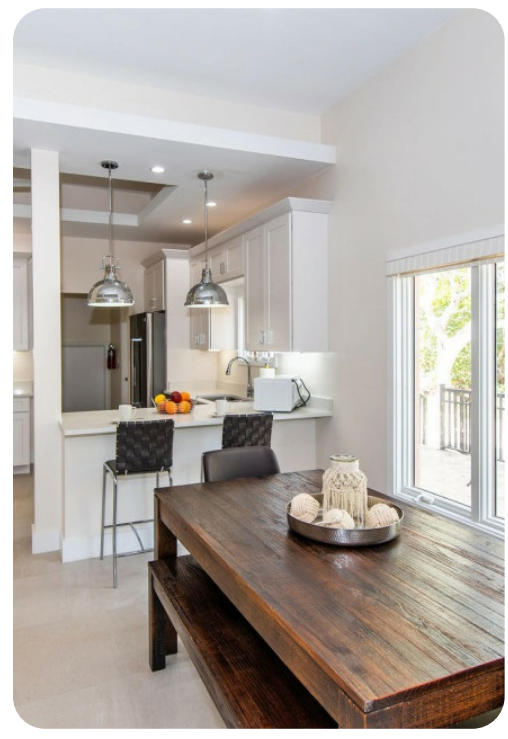
Hidden Cove | Page 2 of 8