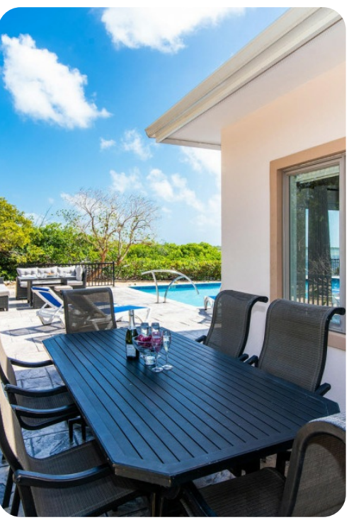
Hidden Cove | Page 7 of 8