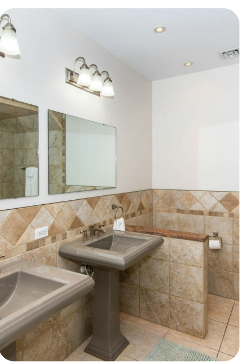
Hidden Cove | Page 4 of 8