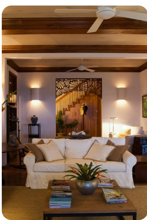
Hidden Bay by the Sea | Page 3 of 8