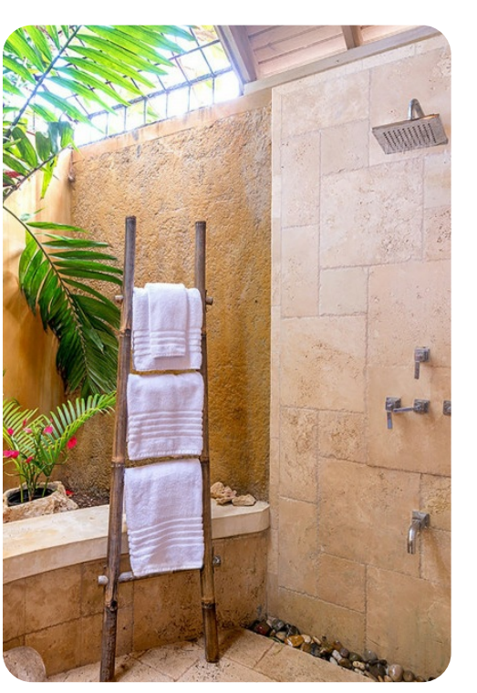
Hidden Bay by the Sea | Page 8 of 8