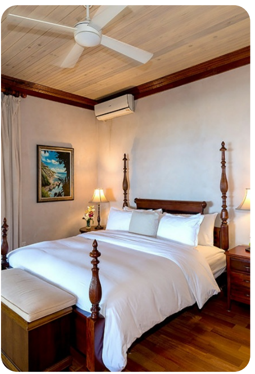
Hidden Bay by the Sea | Page 7 of 8