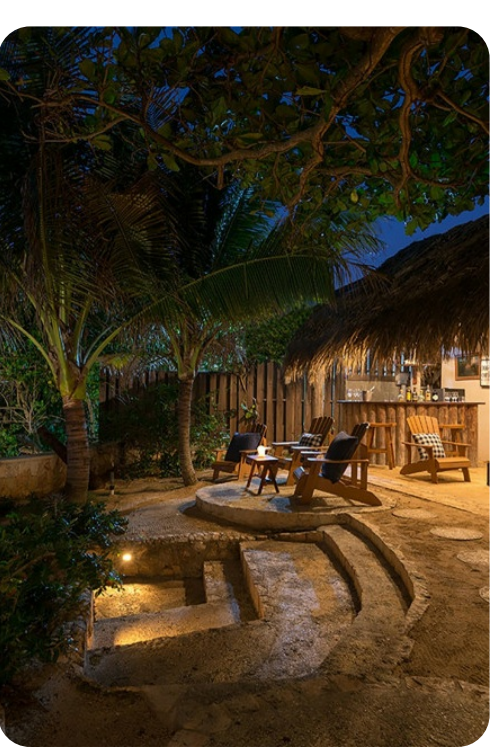
Hidden Bay by the Sea | Page 5 of 8