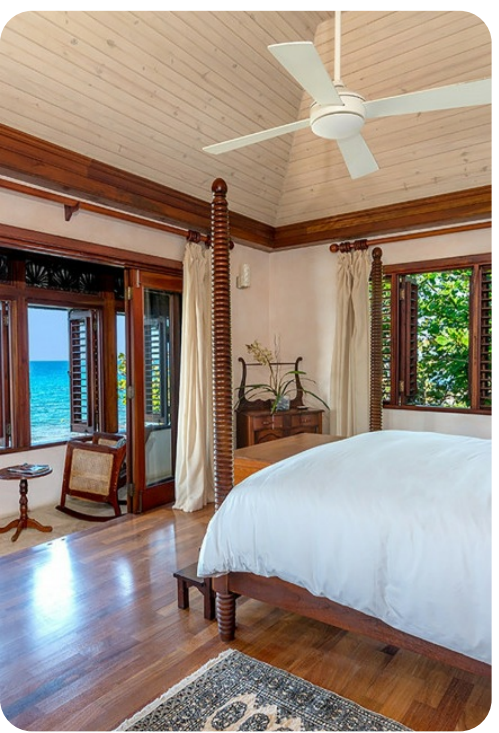
Hidden Bay by the Sea | Page 6 of 8