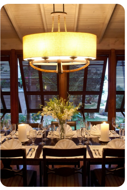
Hidden Bay by the Sea | Page 4 of 8