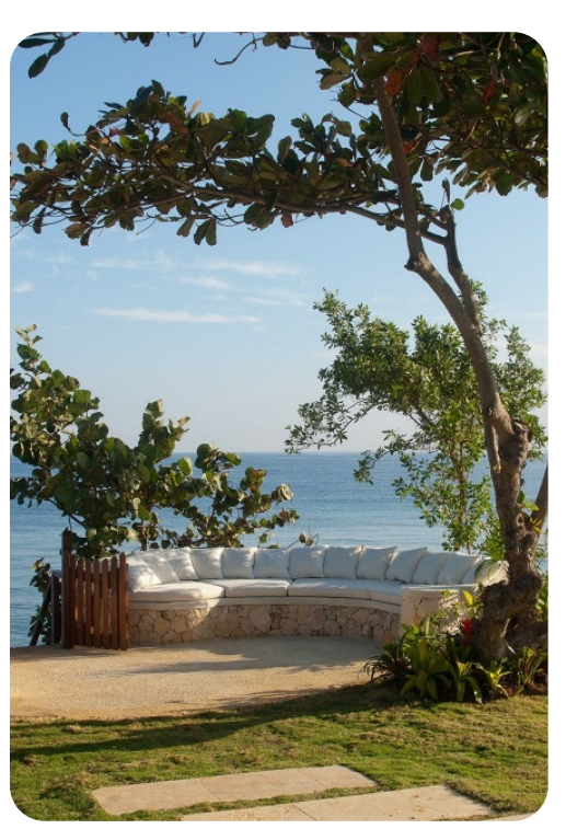
Hidden Bay by the Sea | Page 2 of 8