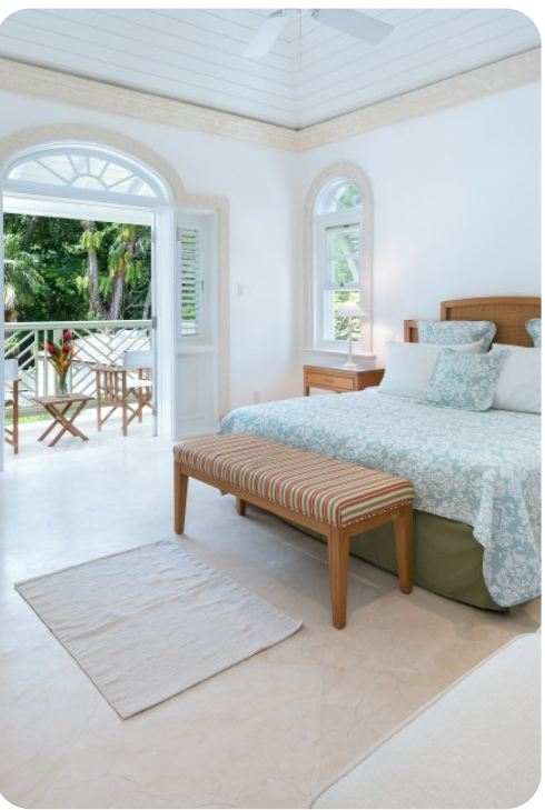
Hemingway House | Page 3 of 4