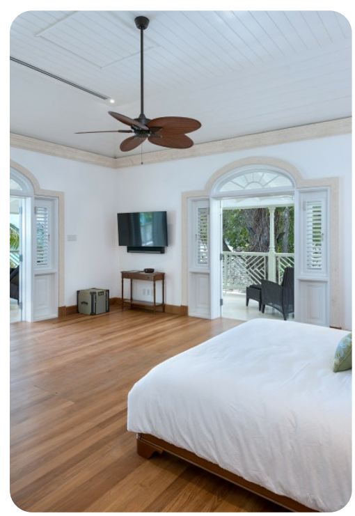
Hemingway House | Page 2 of 4