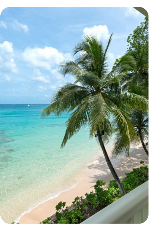
Hemingway House | Page 4 of 4