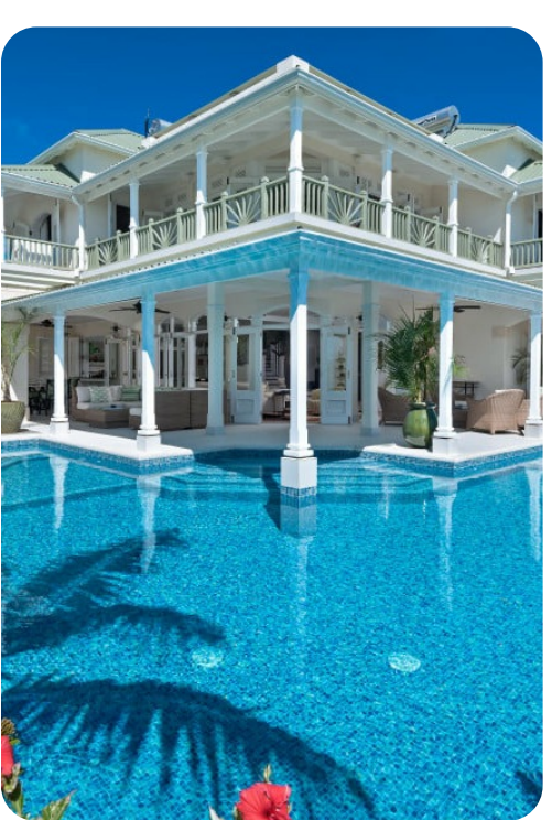
Hectors House | Page 5 of 6