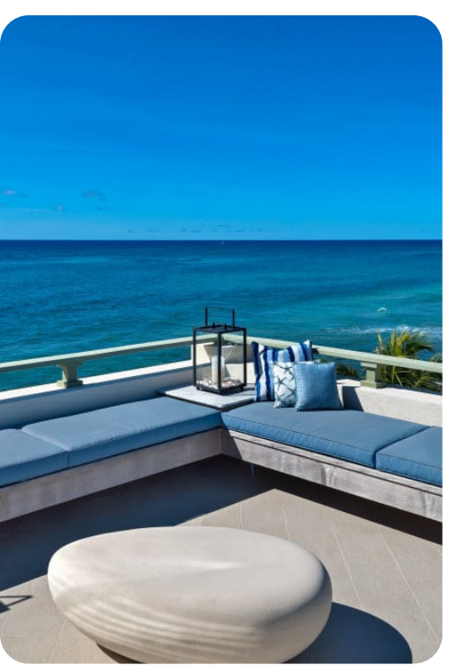
Hectors House | Page 4 of 6