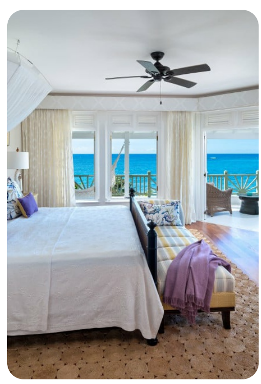
Hectors House | Page 2 of 6