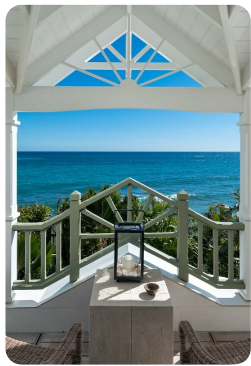
Hectors House | Page 3 of 6