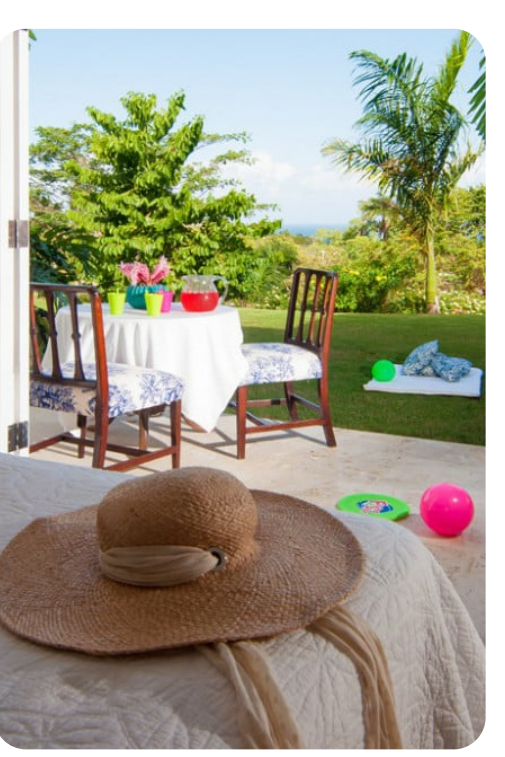
Hanover Windward Garden Villa at the Tryall Club | Page 6 of 8