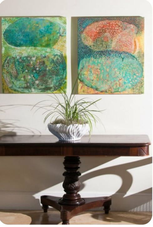
Hanover Windward Garden Villa at the Tryall Club | Page 4 of 8