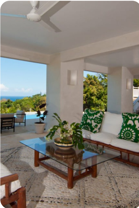
Hanover Windward Garden Villa at the Tryall Club | Page 3 of 8