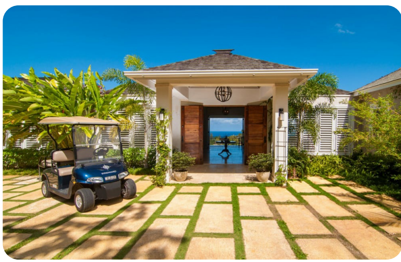
Hanover Windward Garden Villa at the Tryall Club | Page 1 of 8