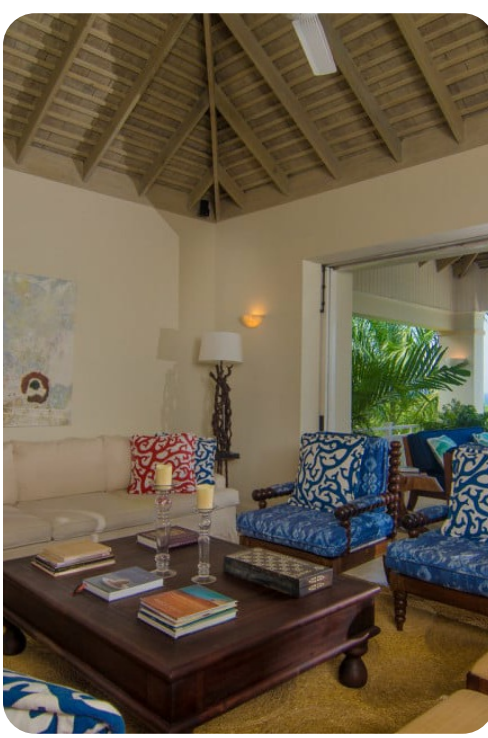
Hanover Windward Garden Villa at the Tryall Club | Page 2 of 8