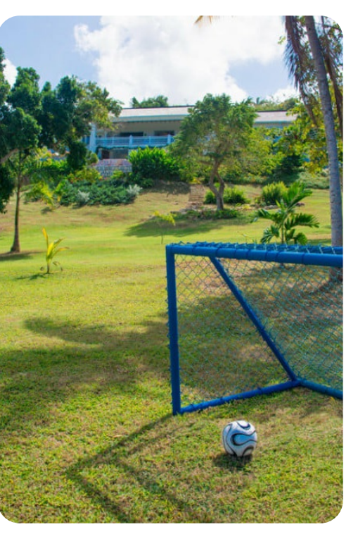
Hanover Windward Garden Villa at the Tryall Club | Page 7 of 8