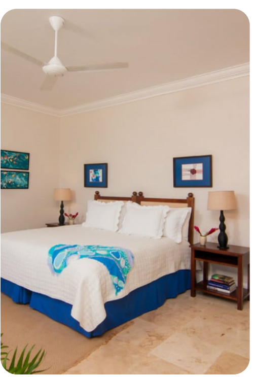
Hanover Windward Garden Villa at the Tryall Club | Page 5 of 8