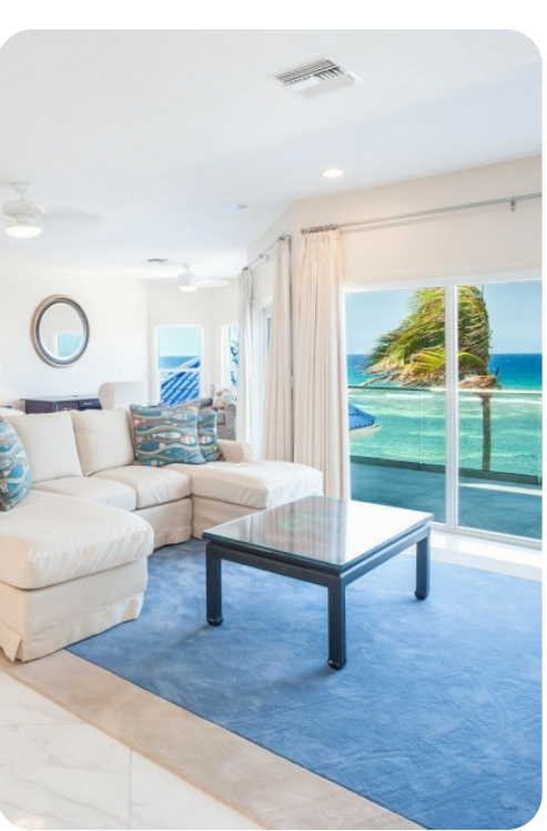
Great Bluff Estates | Page 5 of 8