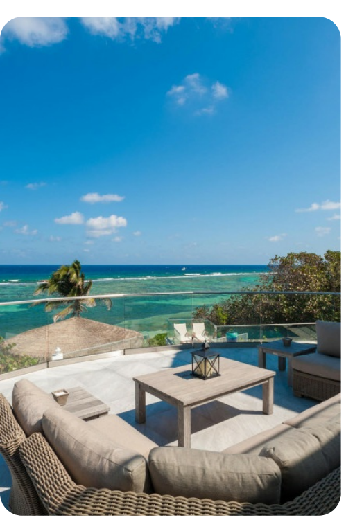
Great Bluff Estates | Page 7 of 8