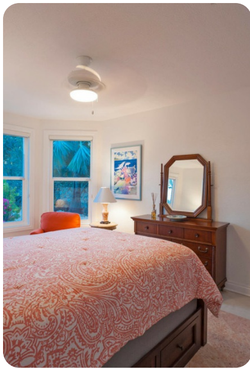
Great Bluff Estates | Page 4 of 8