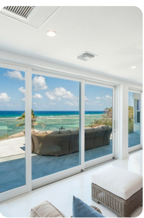
Great Bluff Estates | Page 3 of 8