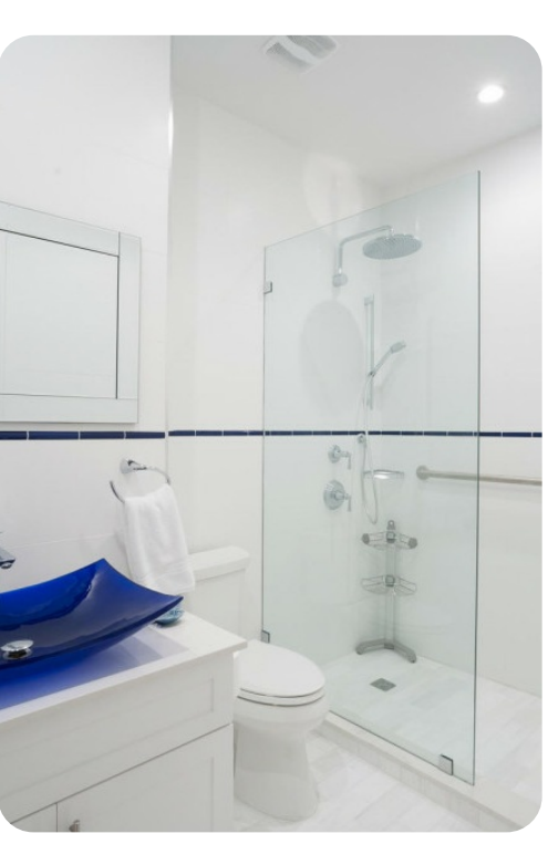
Great Bluff Estates | Page 6 of 8