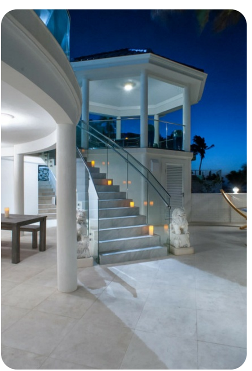
Great Bluff Estates | Page 8 of 8