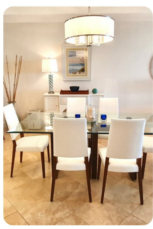
Grandview 202 | Page 2 of 4