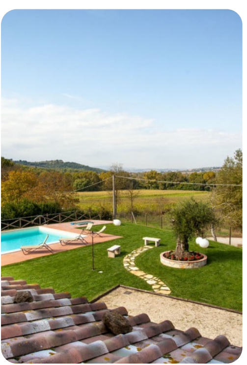
Genius Loci | Page 8 of 8