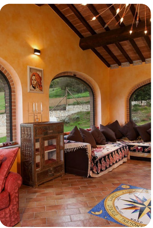
Genius Loci | Page 2 of 8