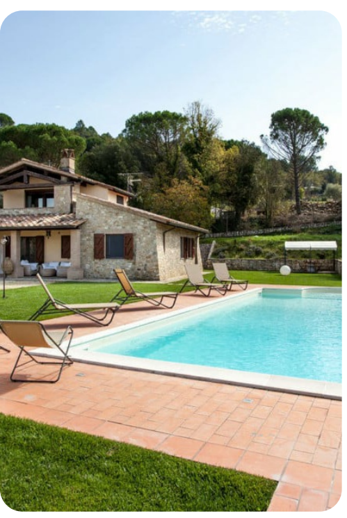
Genius Loci | Page 7 of 8