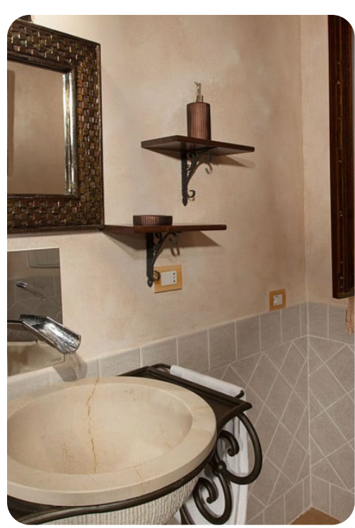
Genius Loci | Page 4 of 8