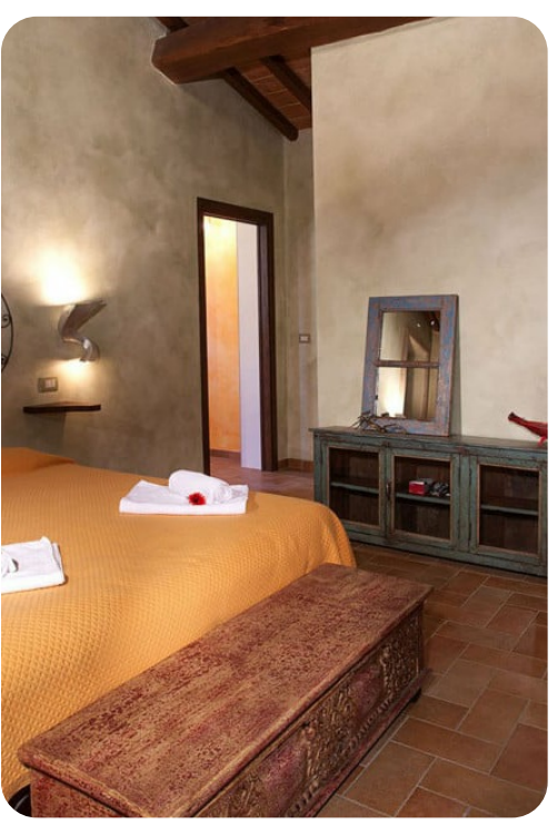
Genius Loci | Page 6 of 8