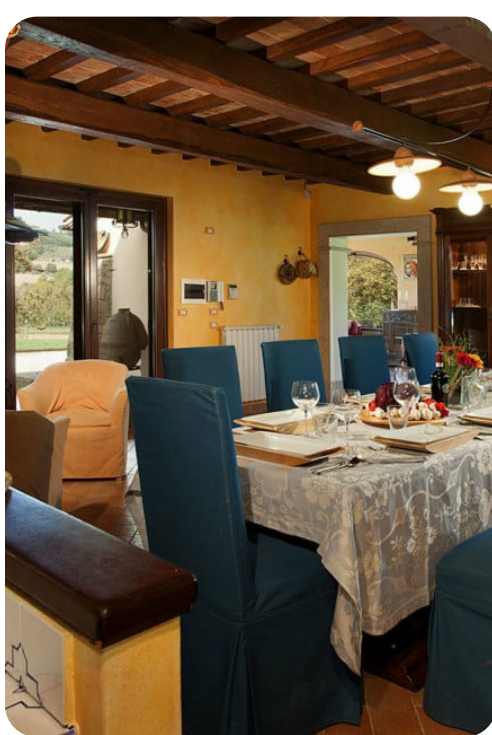
Genius Loci | Page 3 of 8