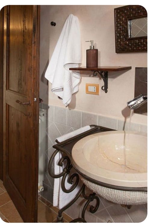
Genius Loci | Page 5 of 8