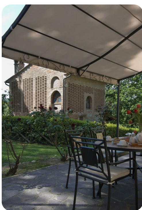
Frantusa | Page 3 of 8