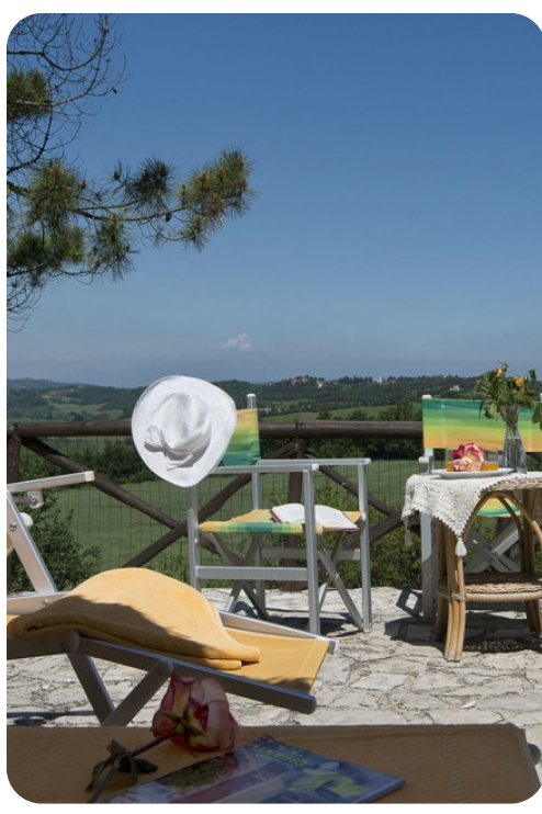
Frantusa | Page 4 of 8