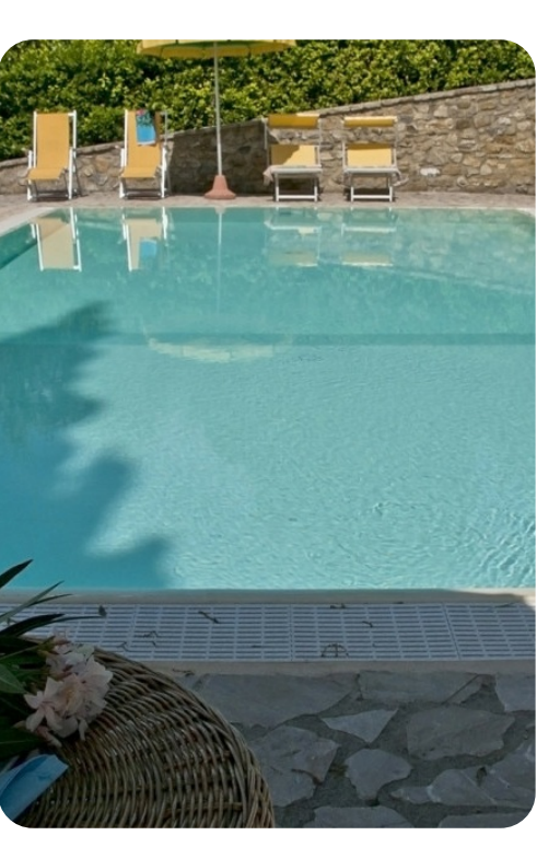
Frantusa | Page 7 of 8