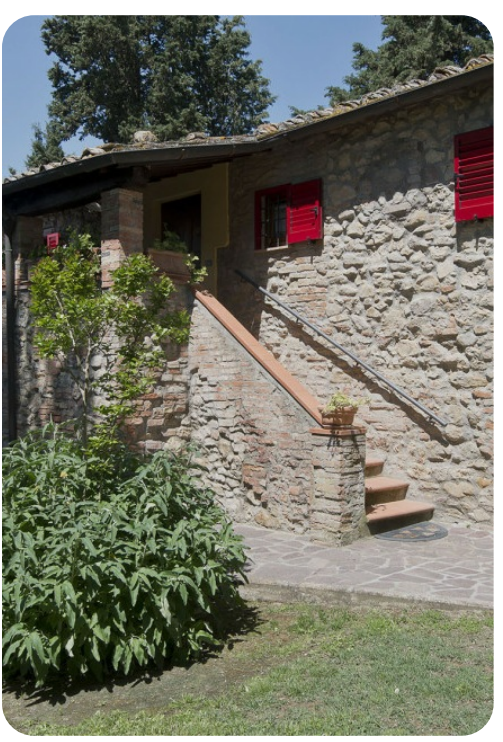
Frantusa | Page 2 of 8