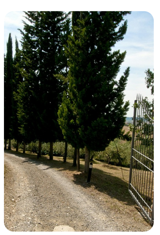
Frantusa | Page 5 of 8