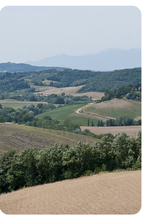
Frantusa | Page 8 of 8