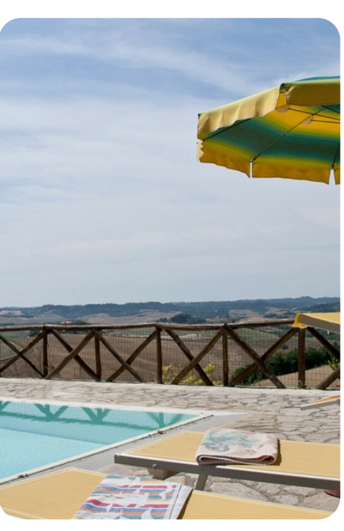
Frantusa | Page 6 of 8