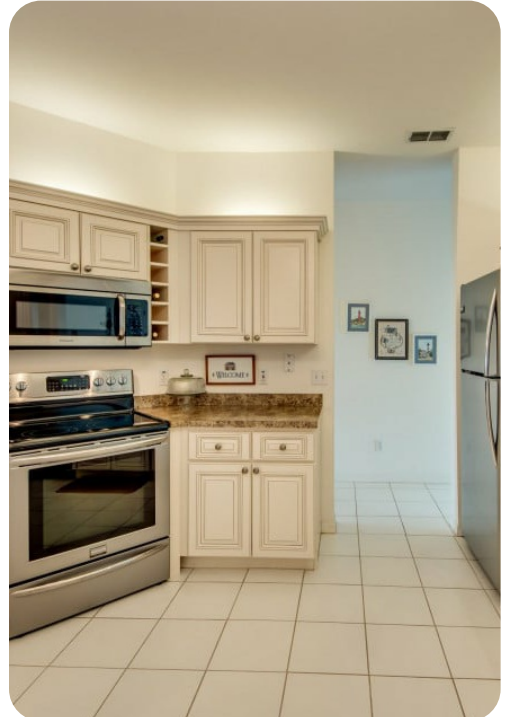
Fort Myers 20 | Page 3 of 7