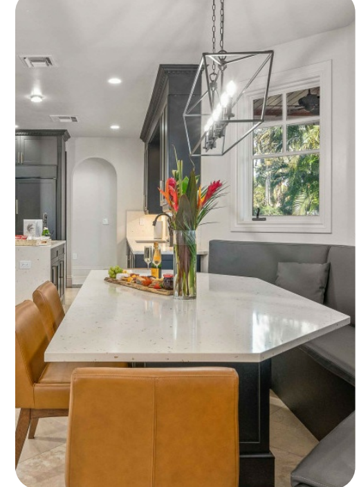
Fort Lauderdale 38 | Page 3 of 8