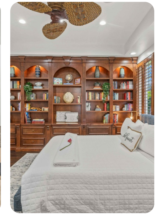
Fort Lauderdale 38 | Page 5 of 8