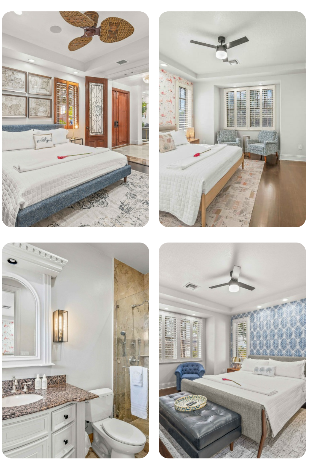
Fort Lauderdale 38 | Page 6 of 8