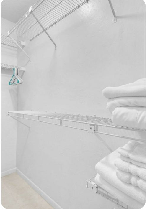
Fort Lauderdale 26 | Page 3 of 4