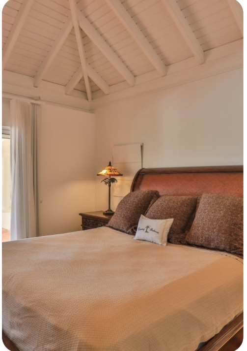
Fields of Ambrosia | Page 5 of 8