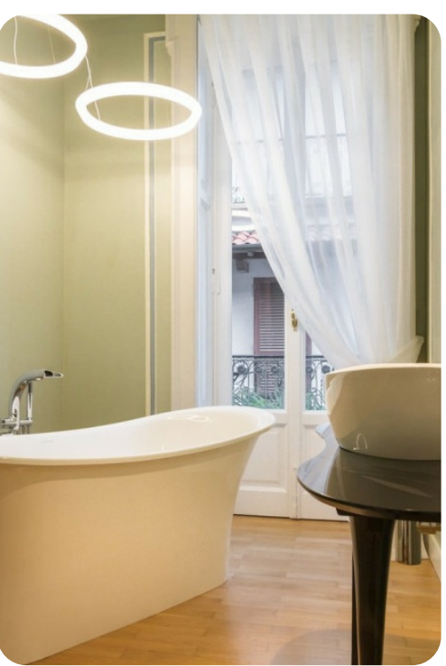
Evania | Page 8 of 8