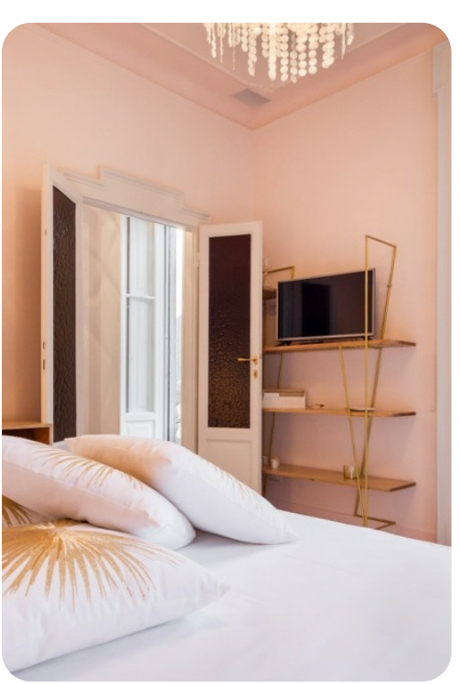
Evania | Page 6 of 8