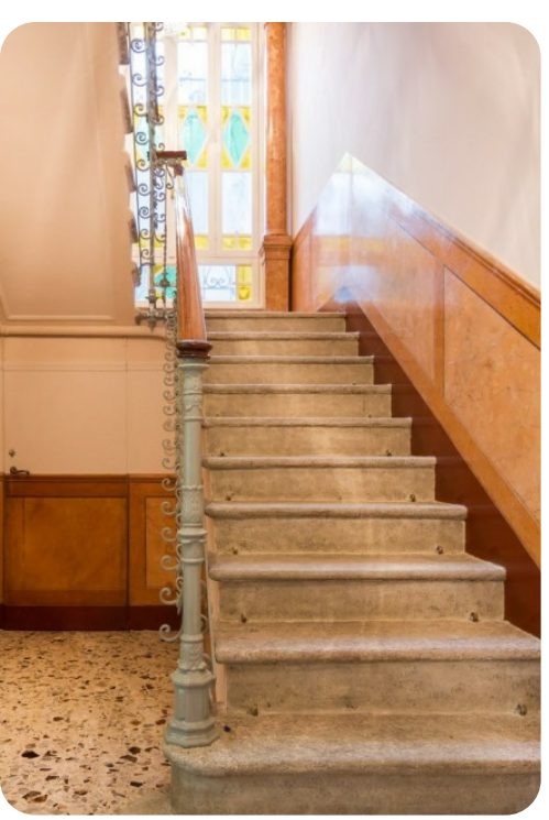
Evania | Page 4 of 8