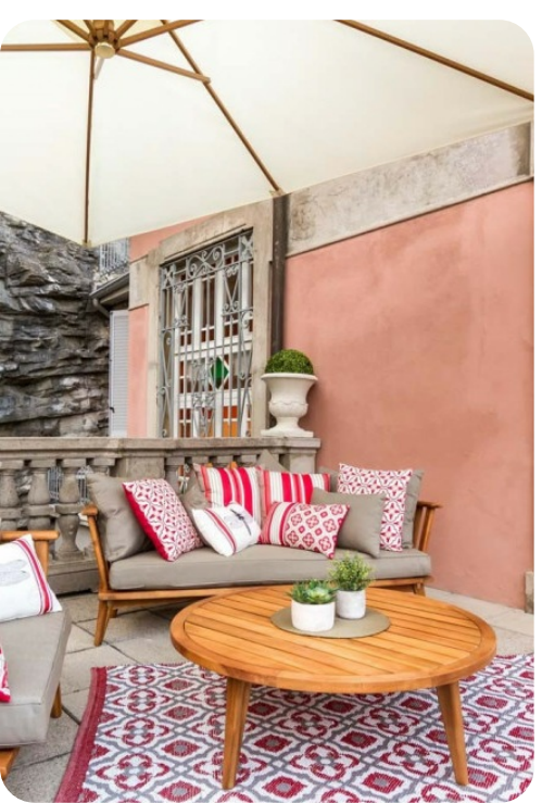
Evania | Page 7 of 8