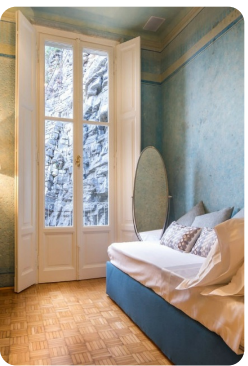
Evania | Page 5 of 8