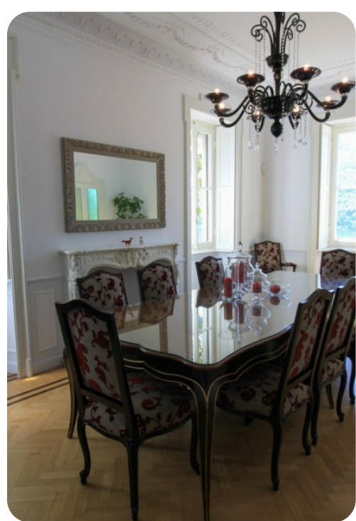
Evania | Page 3 of 8