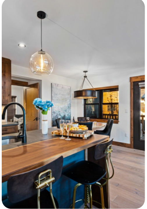
Estes Park 8 | Page 3 of 8